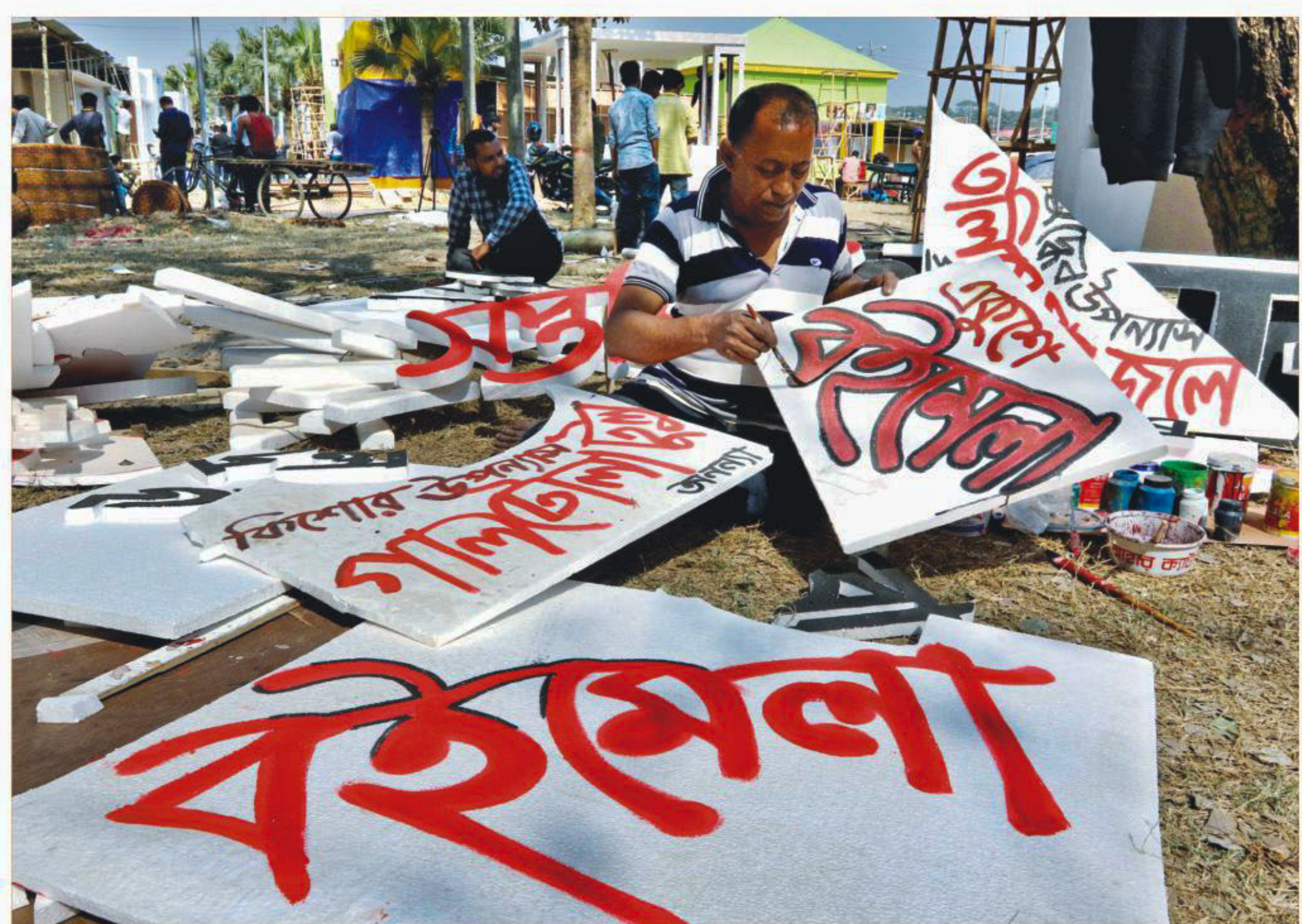
A man paints a sign at the capital's Suhrawardy Udyan yesterday, as part of the last minute preparations for the Amar Ekushey Grantha Mela. The month-long book fair opens today.