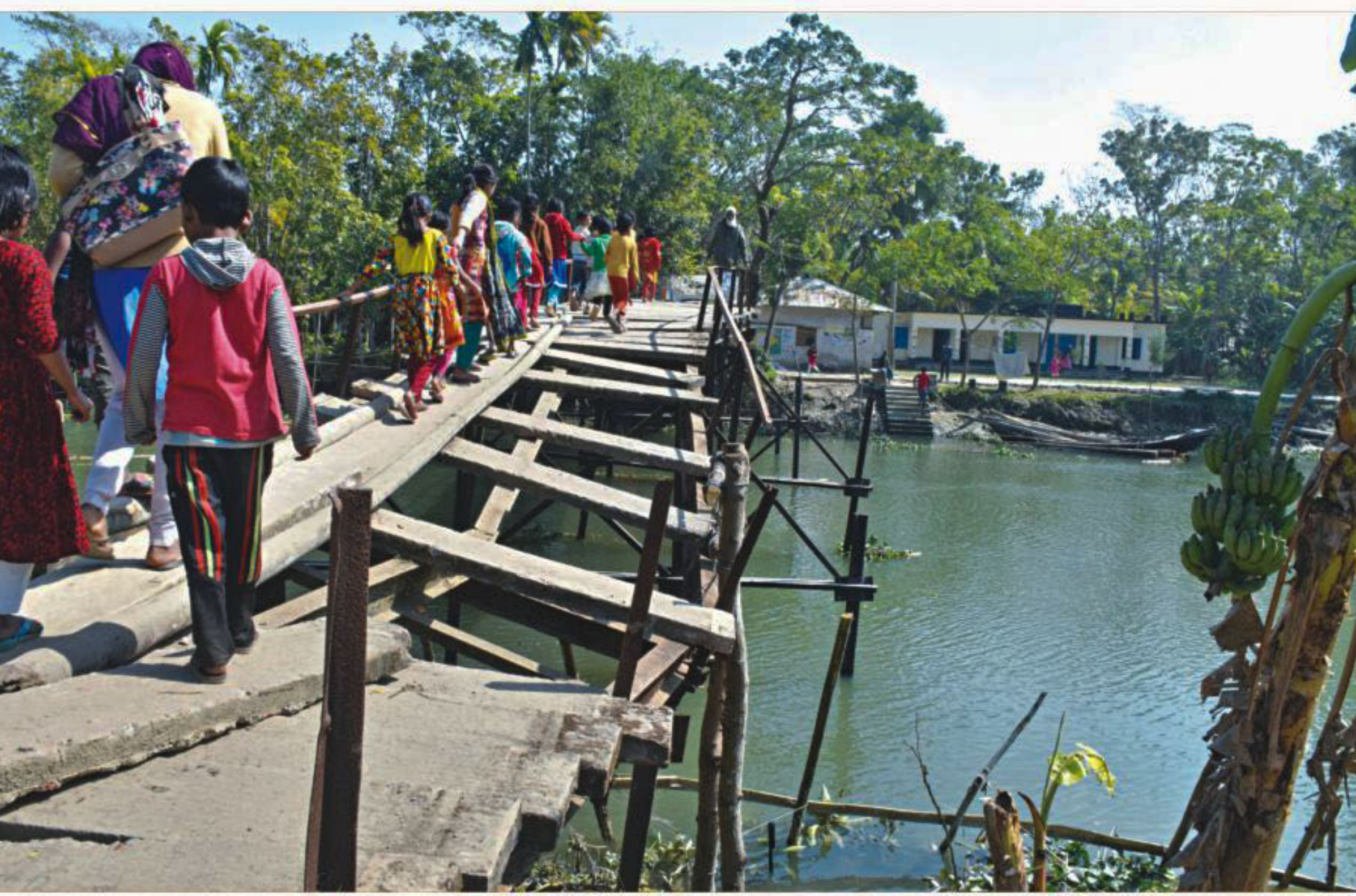
Children cross a rickety bridge in Pirojpur's Jhalakathi Madra village on Wednesday. The bridge has been in such a poor shape for the last four to five months, causing sufferings to the locals, especially the school-goers.

Lessons from Transparency International index SHAKHAWAT LITON The Corruption Perceptions Index released by the Transparency International on Tuesday provides food for thought on corruption and democracy. Its cross analysis with global democracy data reveals a link between corruption and the health of democracy in 180 countries. Full democracies scored an average of 75 out of 100 on the CPI while flawed democracies got an average of 49. Hybrid regimes, which show elements of autocratic tendencies, scored 35. Autocratic regimes performed the worst, with an average score of just 30 on the CPI, according to the analysis. Bangladesh ranked 149th, scoring only 26 against the lowest global average of 43 in the index. Needless to say, it is an embarrassing performance. The score tells where we stand in the categories in terms of functioning of the government. The reasons behind the poor performance of many countries are more or less the same. The persistent failure of most countries to significantly control corruption is contributing to a crisis of democracy around the world, says the TI analysis. TI's remarks on the impact of corruption are relevant to all, and we are no exception. Just a day before the TI released the index, our High Court released the full text of the verdict that doubled BNP Chairperson Khaleda Zia's five-year jail term in a corruption case. The court made a critical observation on the impact of corruption. SEE PAGE 17 COL 5