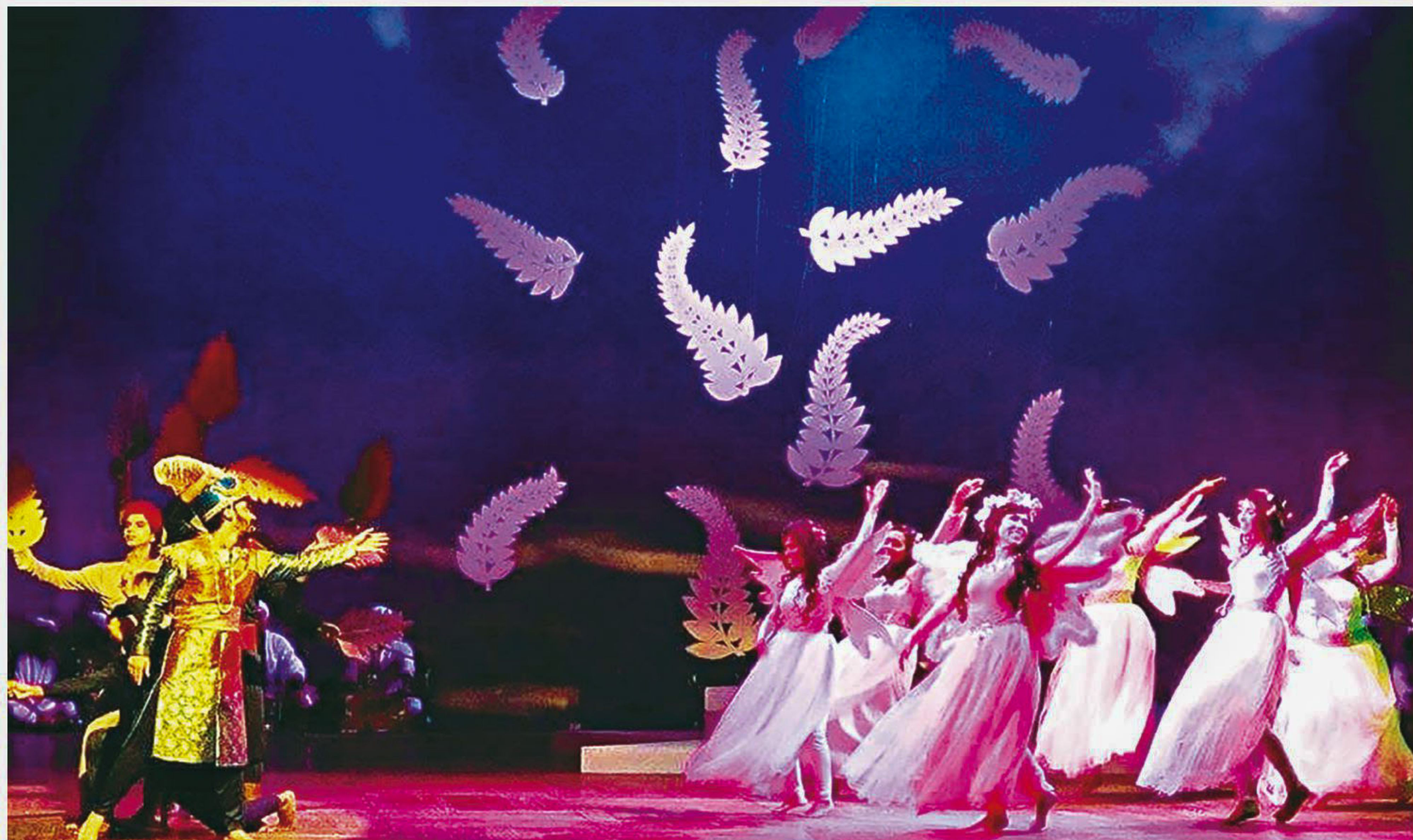
Actors from Nagarik Natyangan performed in the play, 'Gohor Badsha O Banesa Pori.'

will share screen space with Moushumi for the first time in Ratrir Jatri . Other renowned actors in the film include the likes of ATM Shamsuzzaman, Salahuddin Lavlu, Shahidul Alam Sachchu and others. Moushumi has a number of films that are scheduled for release this year. She has also acted in three different commercials targeting the Dhaka International Trade Fair. Alongside her entertainment career, Moushumi is keen to serve the nation as she has purchased a nomination form for a seat in the parliament.