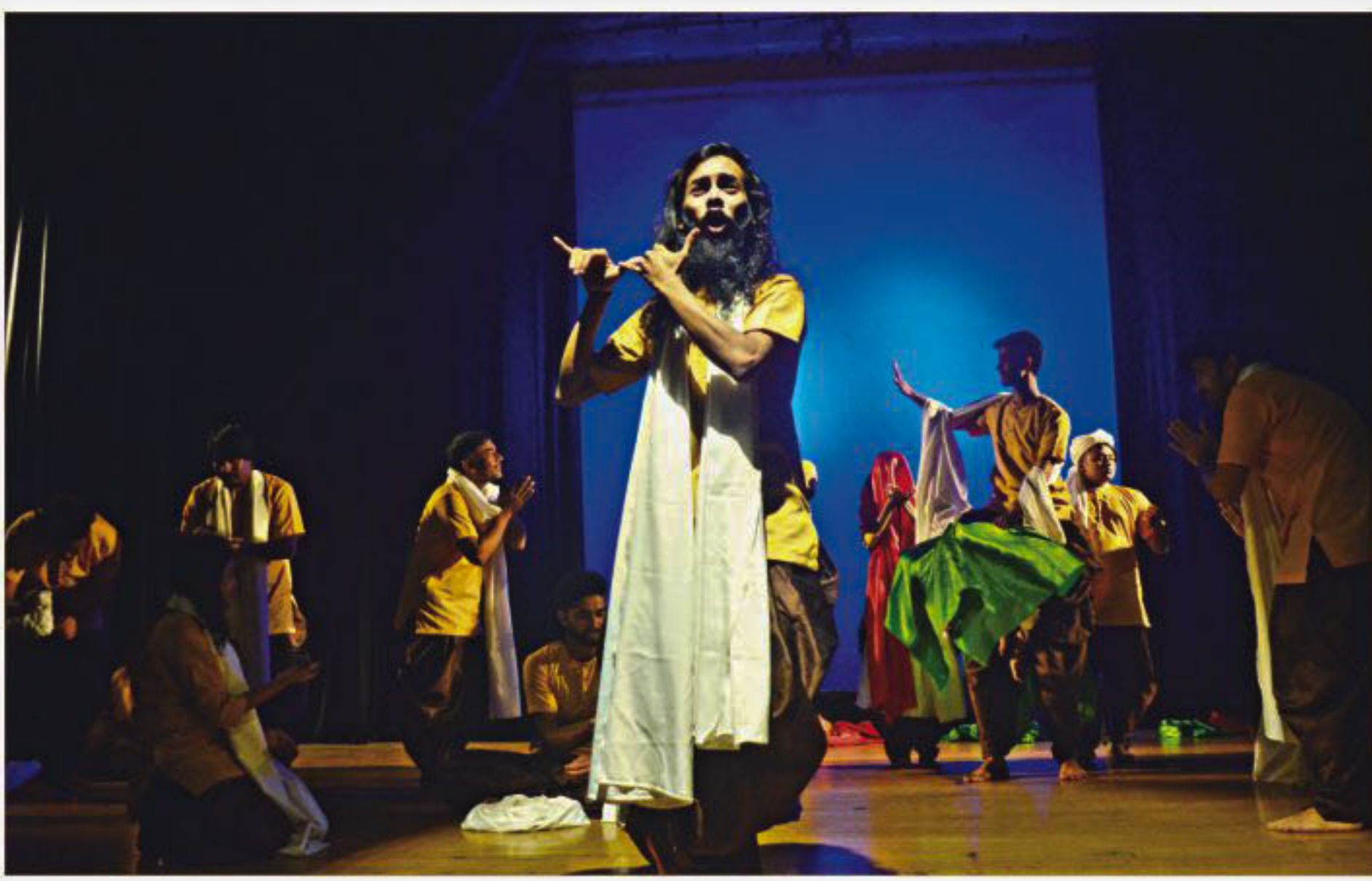
Actors from Natyamancha Sylhet performed in the play, 'Rangamala.'

Mancha Jagao Joygane , the festival was inaugurated by veteran theatre activist Nasir Uddin Yousuf Bacchu. The programme began with Bhola Theatre's play, Gronthikgon Kohen , written by Selim Al Deen. Chapainawabganj's rural folklore troupe took part in the traditional play, Alkap Pancharash , Avaguard from Chattagram staged Nobanno , Fire Asho and Bahurupi Natya Sangtha from Mymensingh staged Mohua . Natyamancha Sylhet staged Rangamala , Nagarik Natyangan from Dhaka staged Gohor Badsha O Banesa Pori and Bibartan from Jashore staged Bratto Ami Montrohi as well.