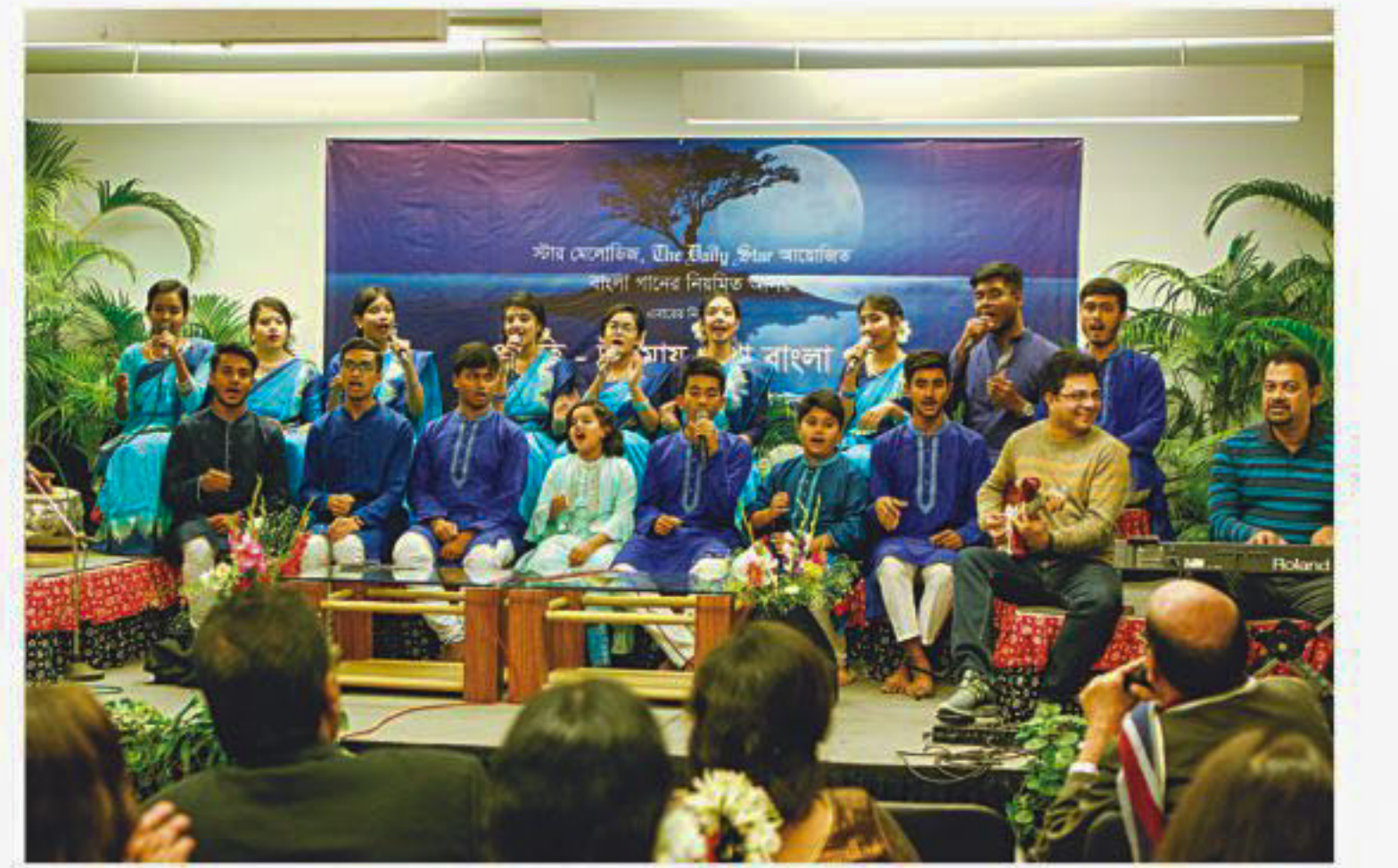
Students of BAF Shaheen College, Dhaka.