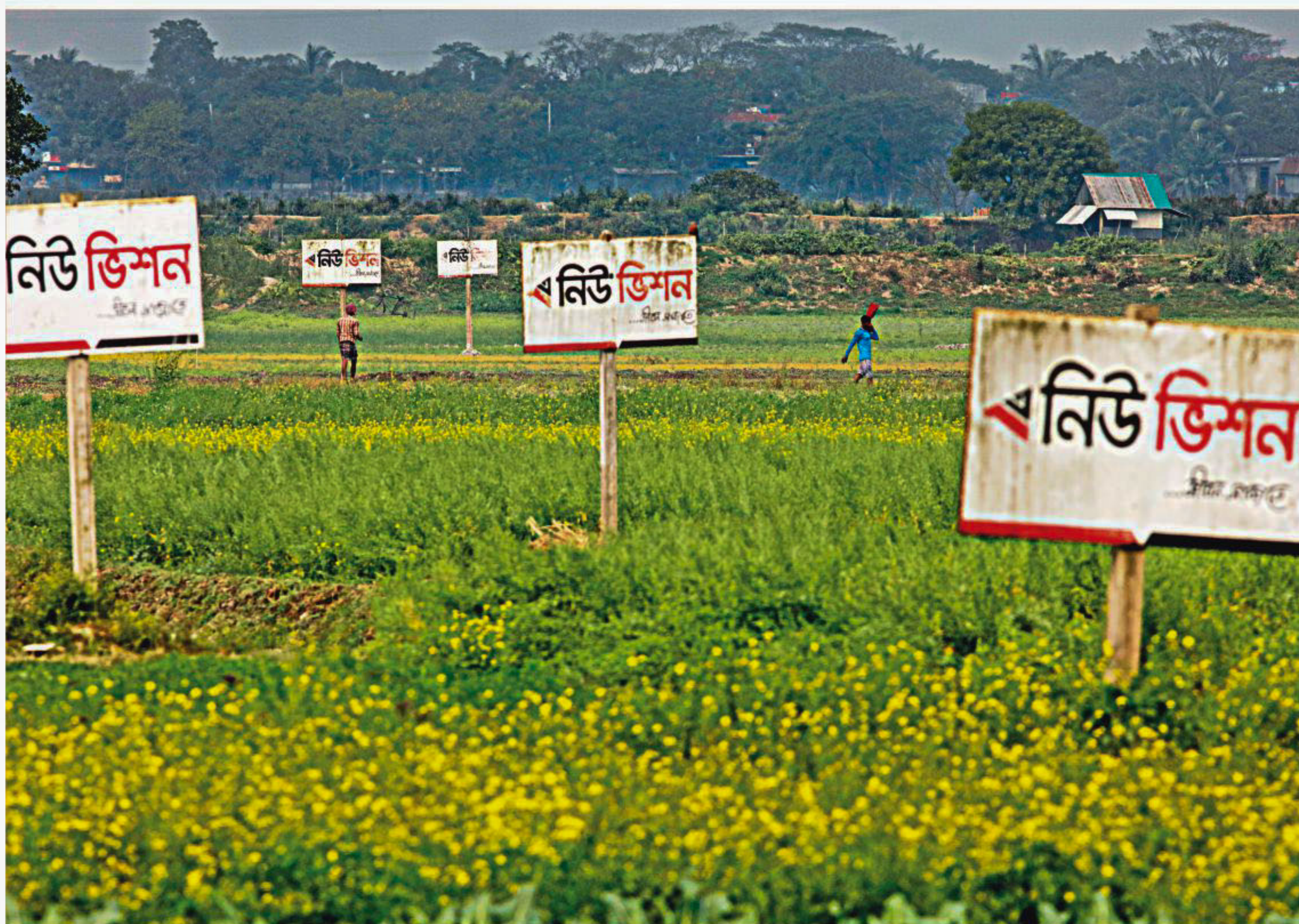
The low-lying land in Kalatiya area beside Dhaka-Keraniganj road is a source of the vegetables that partly feeds Dhaka residents. Like many other arable land near the city, this area is set to be developed for housing projects. The picture was taken recently.