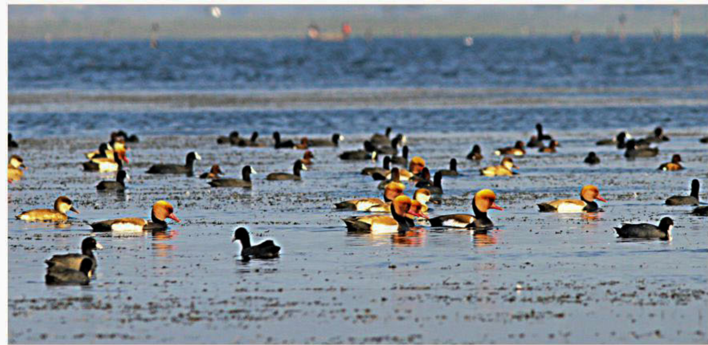
Migratory ducks resting in a beel (large waterbody) in Tanguar Haor.