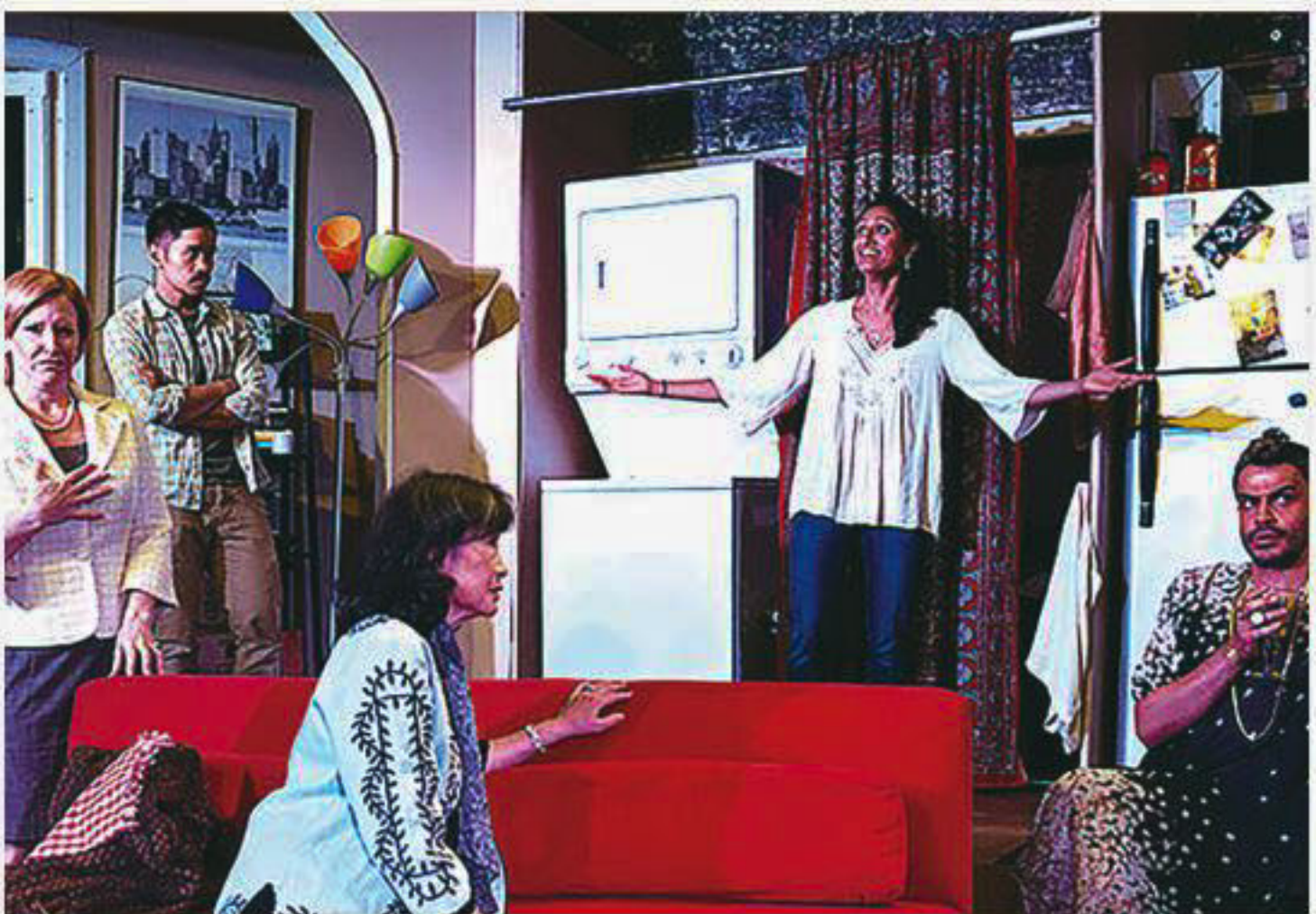
Jackalope Theatre's production, 'Washer Dryer'.