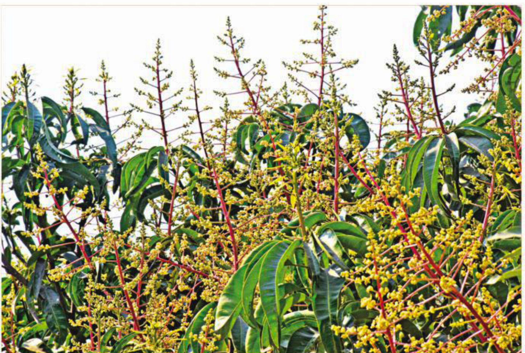
A few mango trees, like this one in Puran Bogura area of the district town, are already in full blossom as favourable weather conditions have helped a bit early arrival of flowers in the popular summer fruit trees in the area.

In another drive, the same court on Monday fined brick kiln owner Abdus Sobhan Tk 50,000 for violating existing rules.