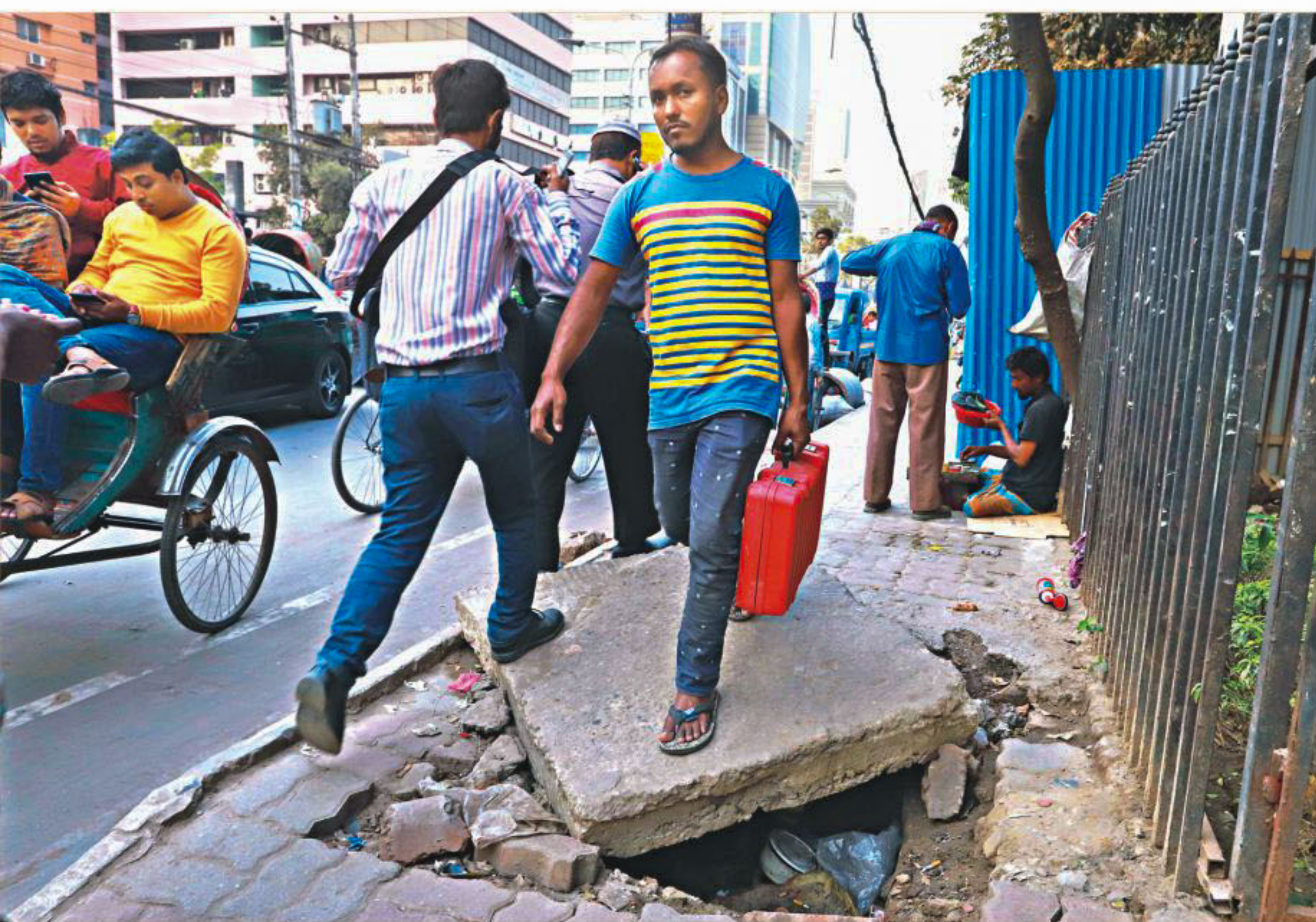
With a damaged concrete slab partially covering a sewer, walking along this footpath has become a balancing act for pedestrians. The photo was taken in Bangla Motor area on Monday.