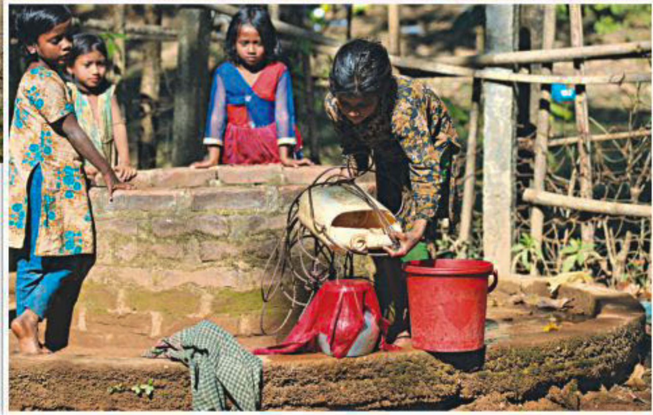
Faced with a shortage of water, women and children take long walks to a waterbody to bathe and do laundry at Sreepur tea estate in Sylhet's Gowainghat upazila. Inset, children in the area collect water from a well that has almost run dry. The pictures were taken last week.