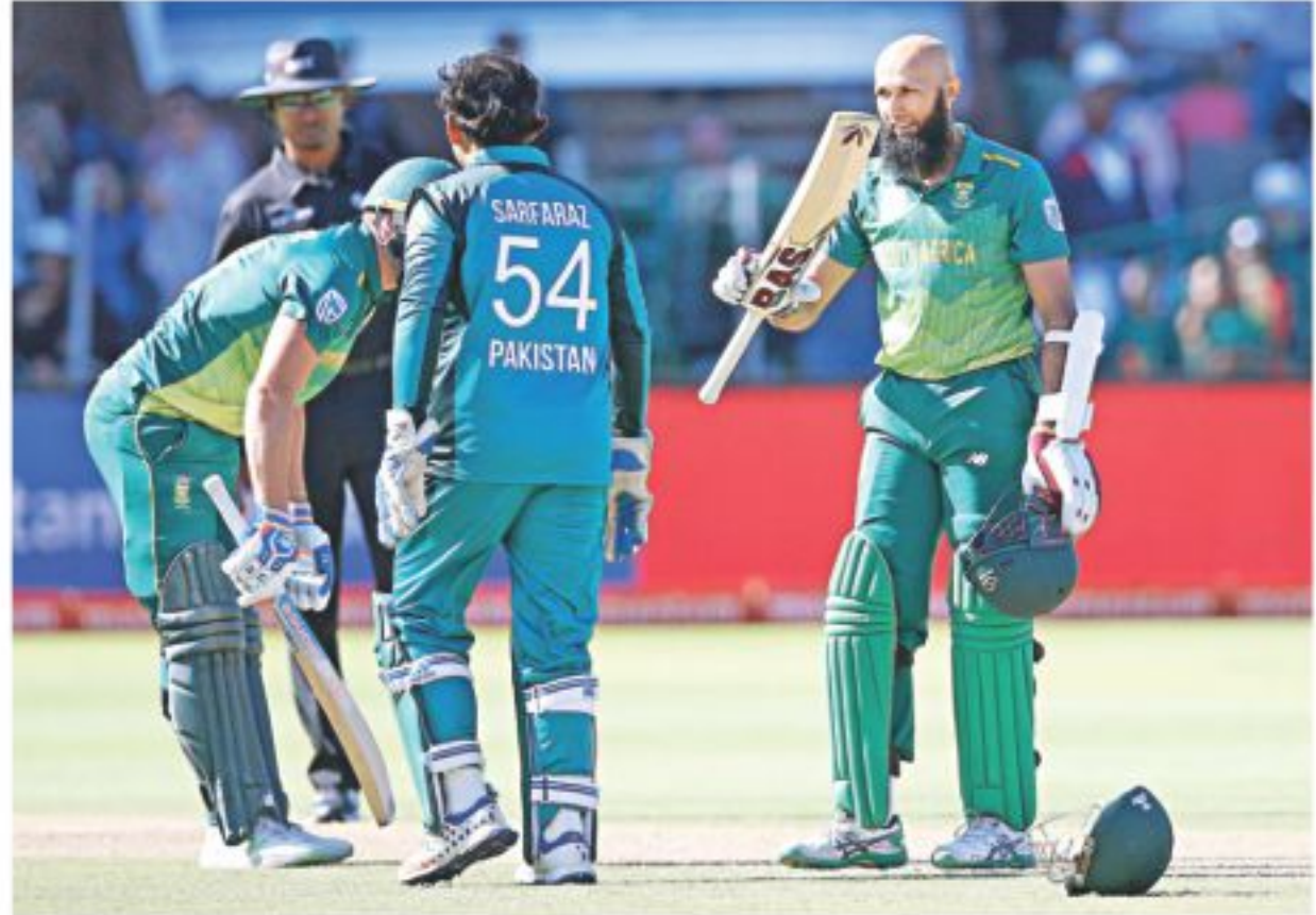
South Africa batsman Hashim Amla (R) celebrates after scoring a century during the first ODI against Pakistan in Port Elizabeth yesterday. Opener Amla remained unbeaten through South Africa's innings but his effort eventually went in vain.

SCORES IN BRIEF SOUTH AFRICA: 266 for 2 in 50 overs (Amla 108 not out, Hendricks 45, Van der Dussen 93; Hasan 1-42, Shadab 1-41) PAKISTAN: 267-5 in 49.1 overs (Imam-ul-Haq 86, Babar 49, Hafeez 71 not out, Shadab 18 not out; Olivier 2-73) Result: Pakistan won by 5 wickets.