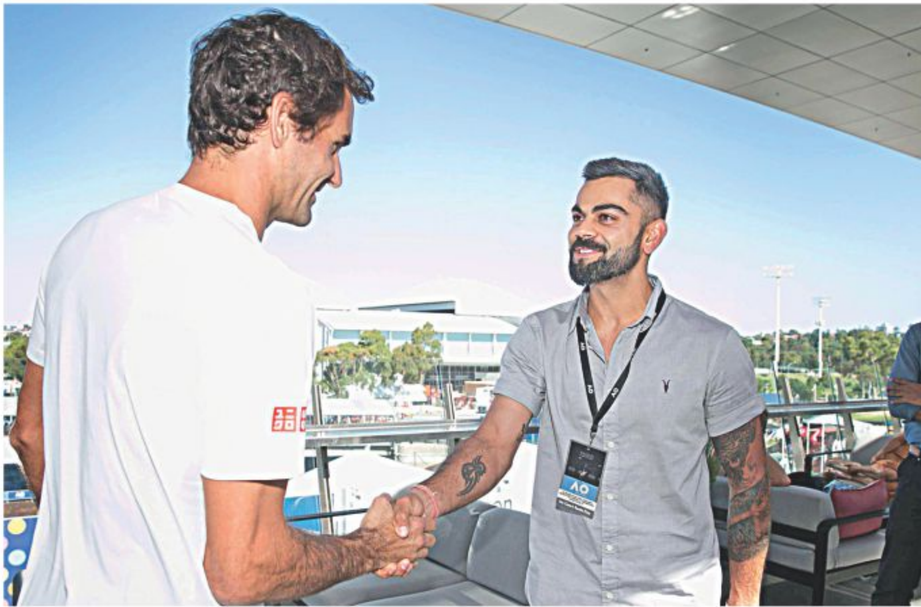
With their tour of Australia done and dusted, India captain Virat Kohli (R) stuck around for a while to watch the ongoing Australian Open in Melbourne. Here, Kohli is seen chatting with one of tennis's Big 3 Roger Federer yesterday.