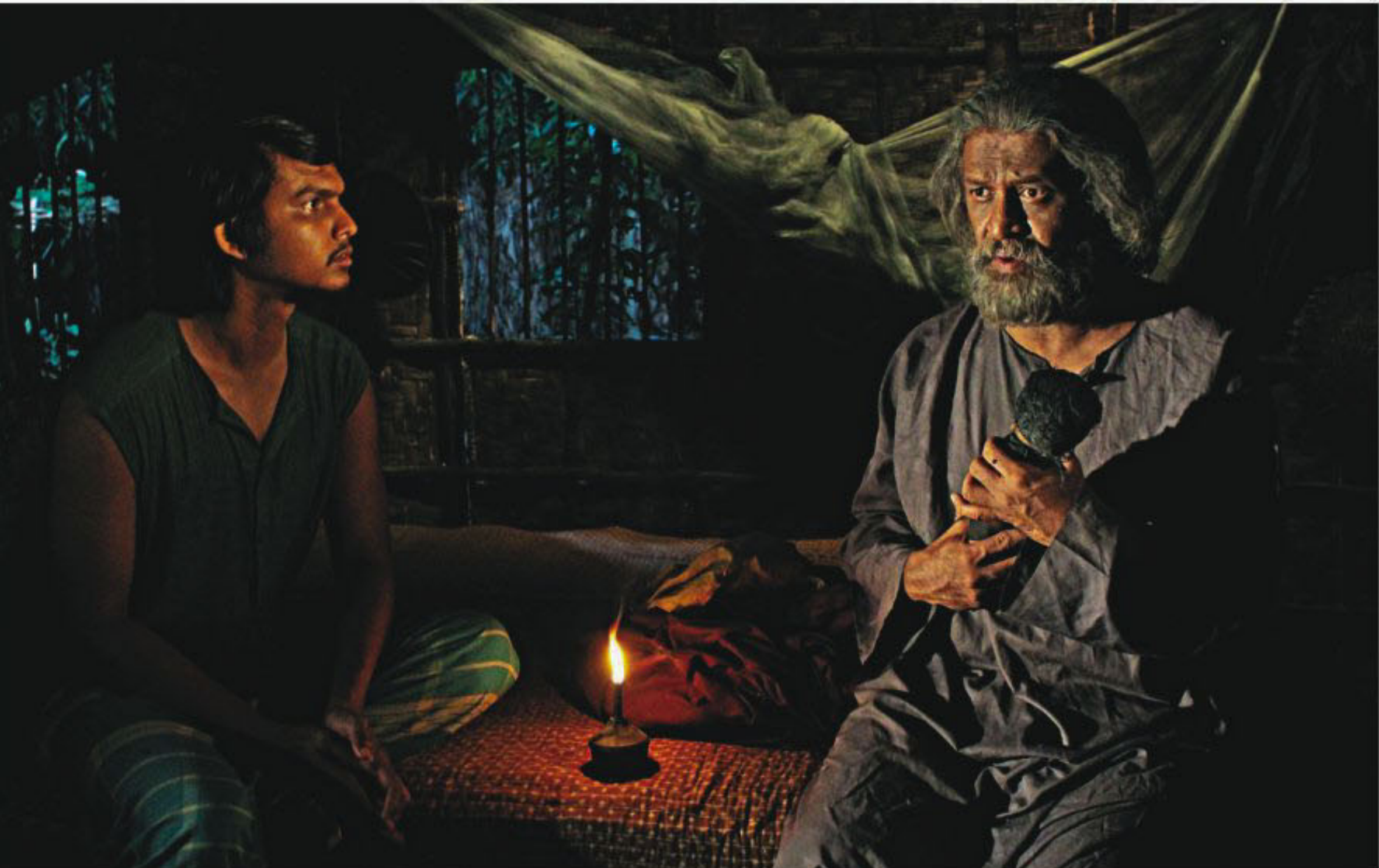
A still from the film 'Gor'.