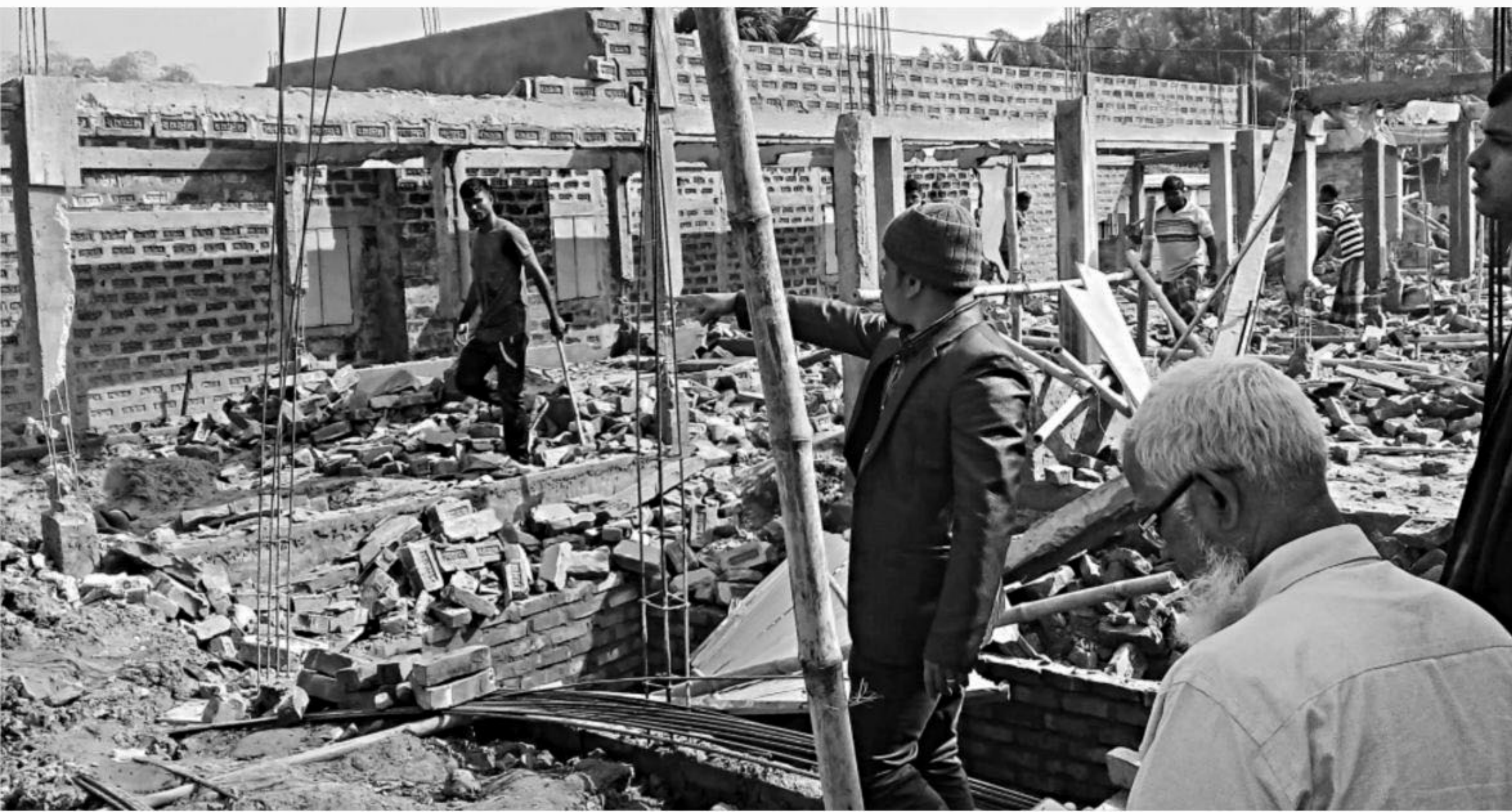
Bangladesh Railway in a drive demolishes over 100 illegal structures at the western side of Shamsheernagar railway station area in Moulvibazar's Kamalganj upazila on Wednesday.