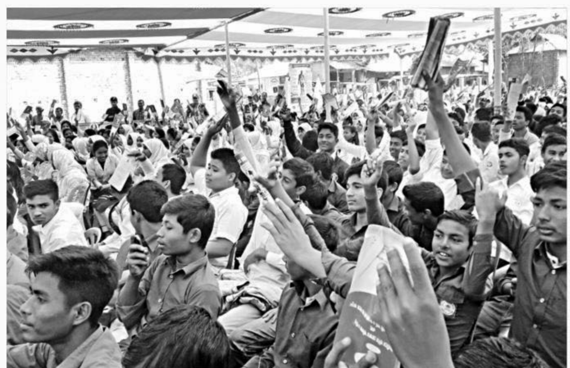
Students of different schools and colleges pledge to fight against social menaces like child marriage, dowry and drug abuse at a programme organised by Lalmonirhat Sadar Upazila Parishad on the ground of Etapota Adarsha High School yesterday.

"Tipped off, a DB team led by OC Shaymal Dutta arrested the two brothers with the pistol and bullets from the village. They are accused in several narcotics related cases, said ASP Mohammad Ahaduzzaman in Tangail.