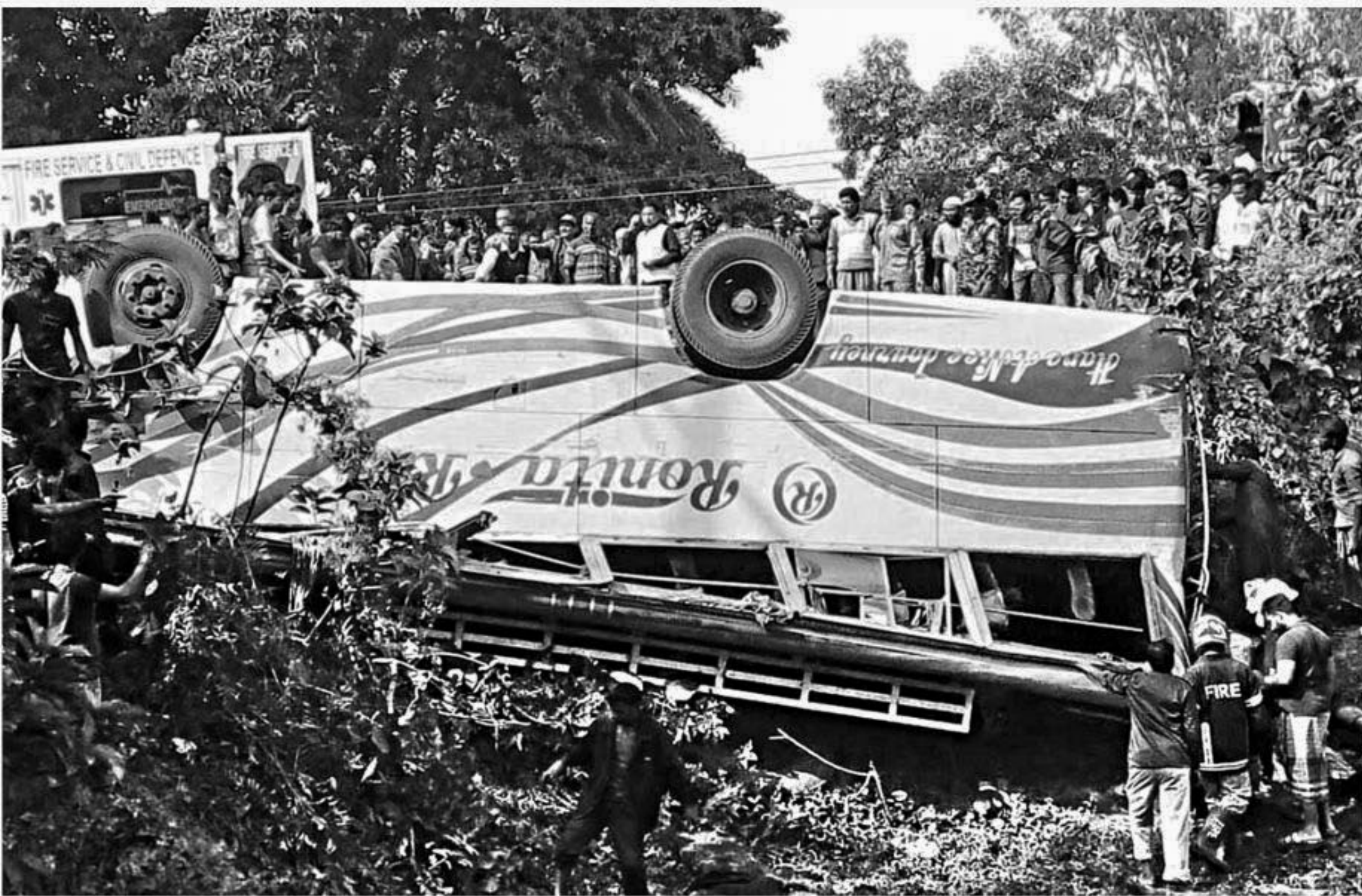
Fire service personnel in operation to rescue injured persons from an overturned bus that skidded off Tangail-Mymensingh road in Kalihati area yesterday.