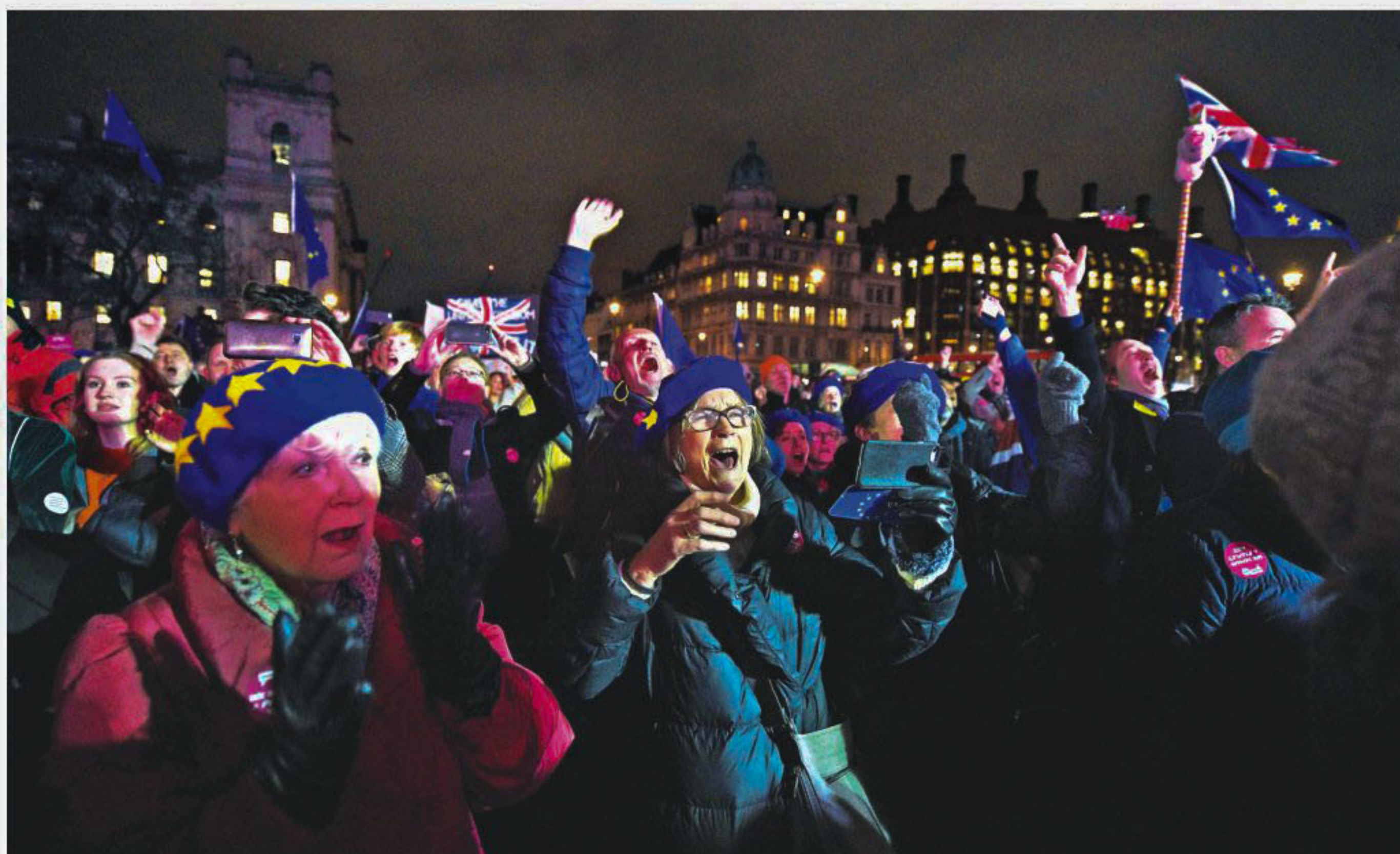
People react as they watch the results being announced from the MPs vote on the government's motion on the Brexit Withdrawal Bill in the House of Commons on a big screen in Parliament Square in central London on Tuesday. British lawmakers voted overwhelmingly to reject the EU divorce deal struck between London and Brussels, in a historic vote that leaves Brexit hanging in the balance.