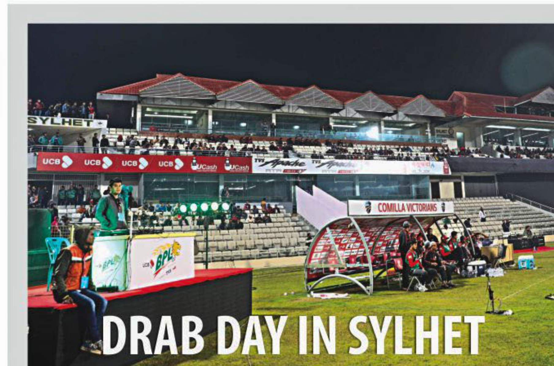
Even though the Dhaka leg of this year's BPL witnessed a low turnout, many assumed that the Sylhet phase would get bigger crowds. However, the first day of play in Sylhet turned out to be dull both on and off the pitch as uncompetitive matches were played out in front of sparse crowds.