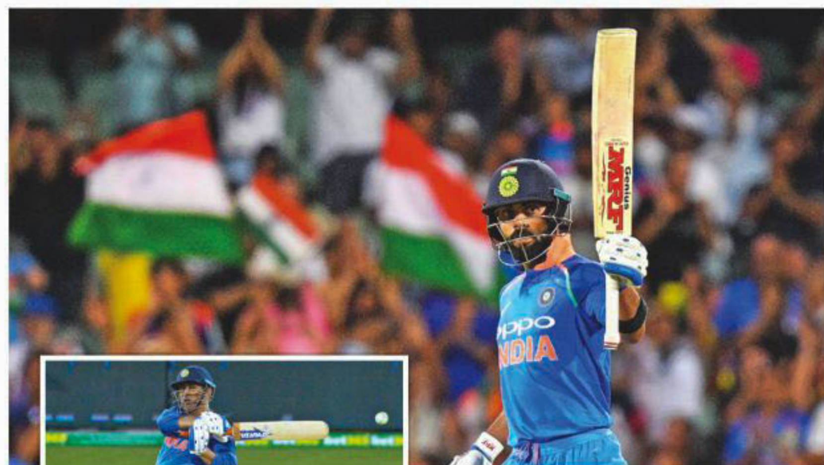
India captain Virat Kohli celebrates his century in the second ODI against Australia yesterday. The visitors won by six wickets courtesy of a late 55-run surge from (Inset) MS Dhoni.