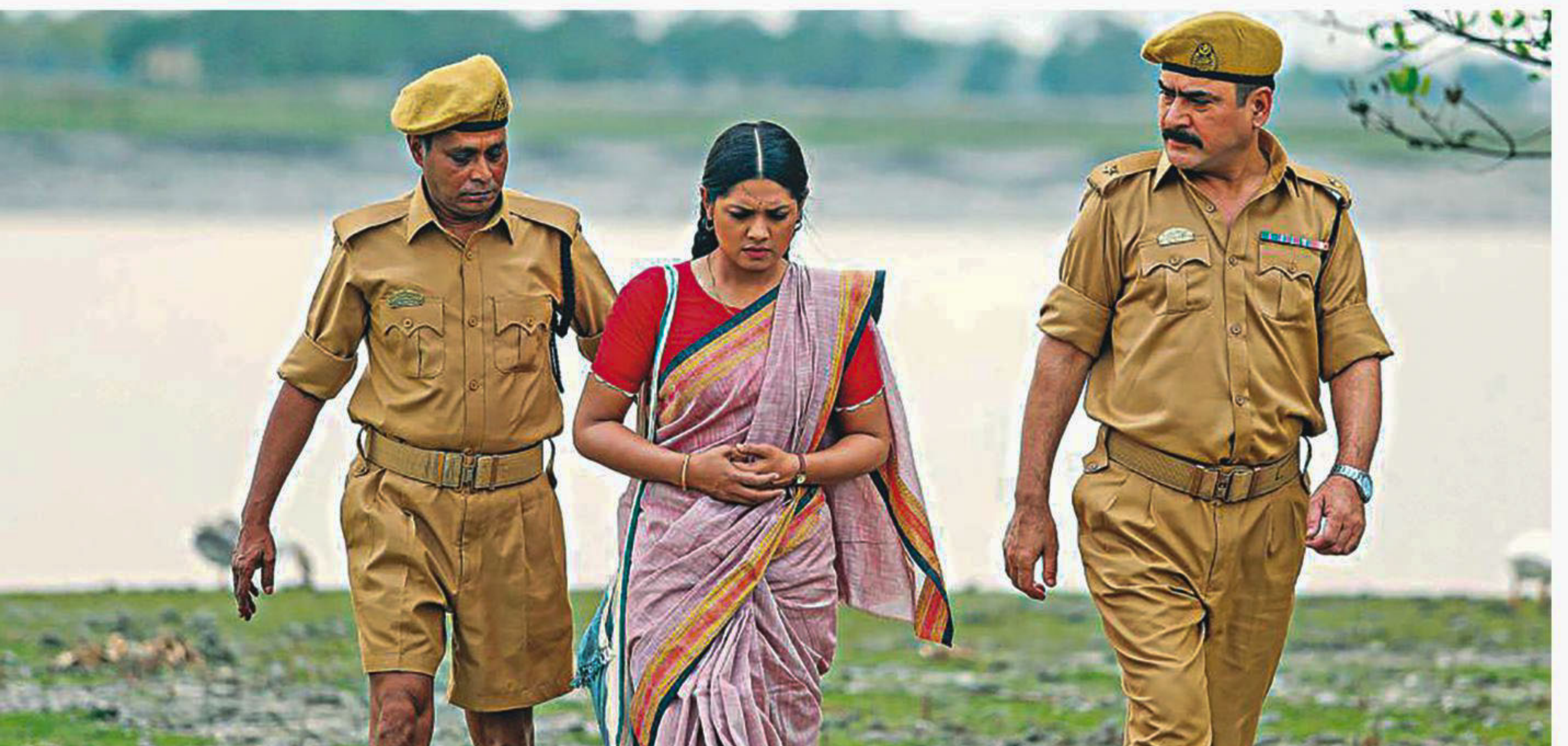
A still from the film.

Bulbul Chowdhury Birth Centenary Organisers: BSA & BNSS Venue: Bangladesh Shilpakala Academy Yearlong Celebration currently