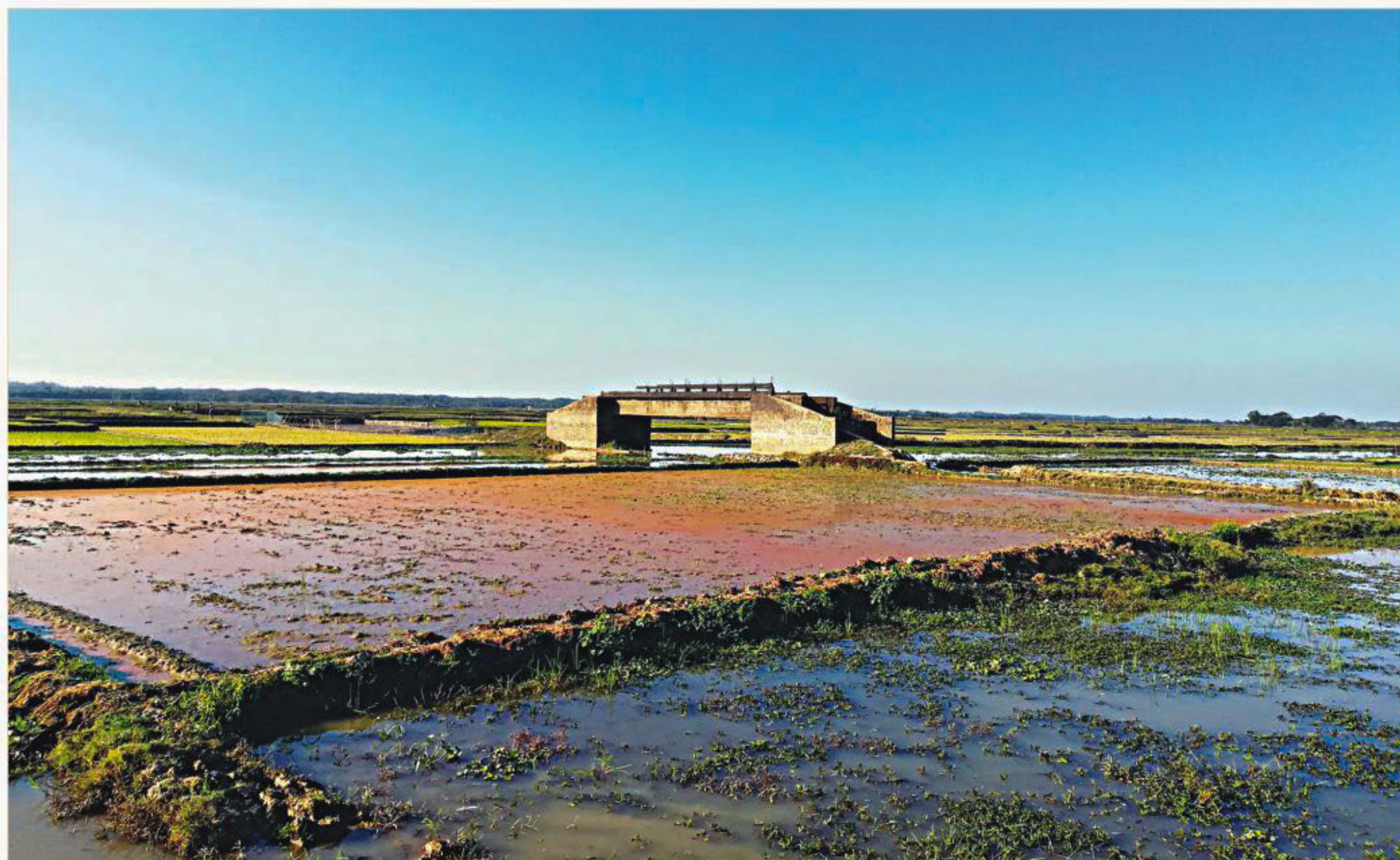
THE LONESOME BRIDGE... With no approach roads, this bridge has been lying unused at Chilarkandi village in Moulvibazar's Kulaura upazila since its construction 21 years ago. The picture was taken recently. Story on page 2.