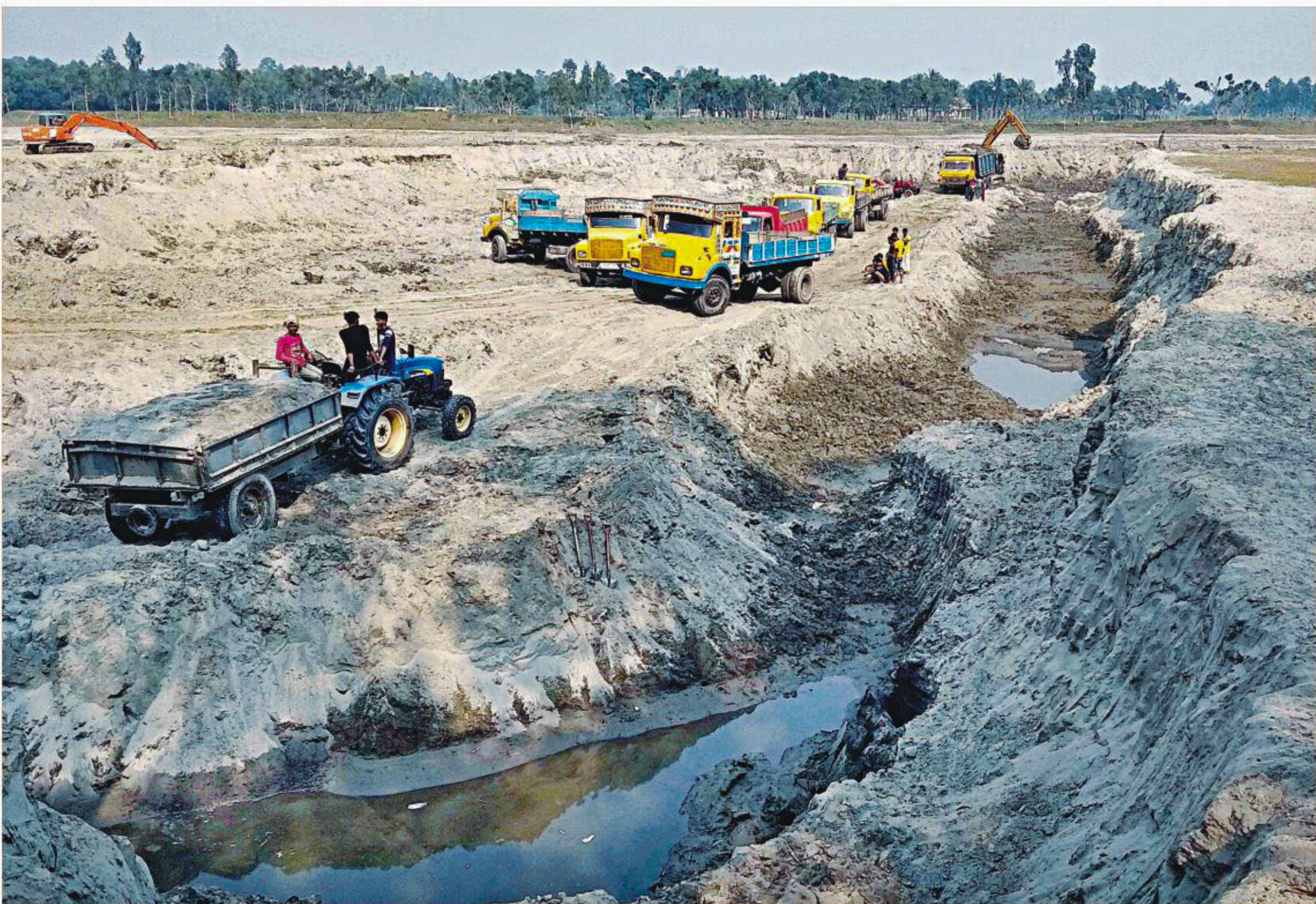
Trucks and tractors carry illegally lifted sand from the banks of Dhaleshwari river in Tangail while an excavator continues to lift sand in the distance. According to Sand Fields and Soil Management Act, 2010, extracting sand from open places and from the river bed for commercial purposes is a punishable offence.