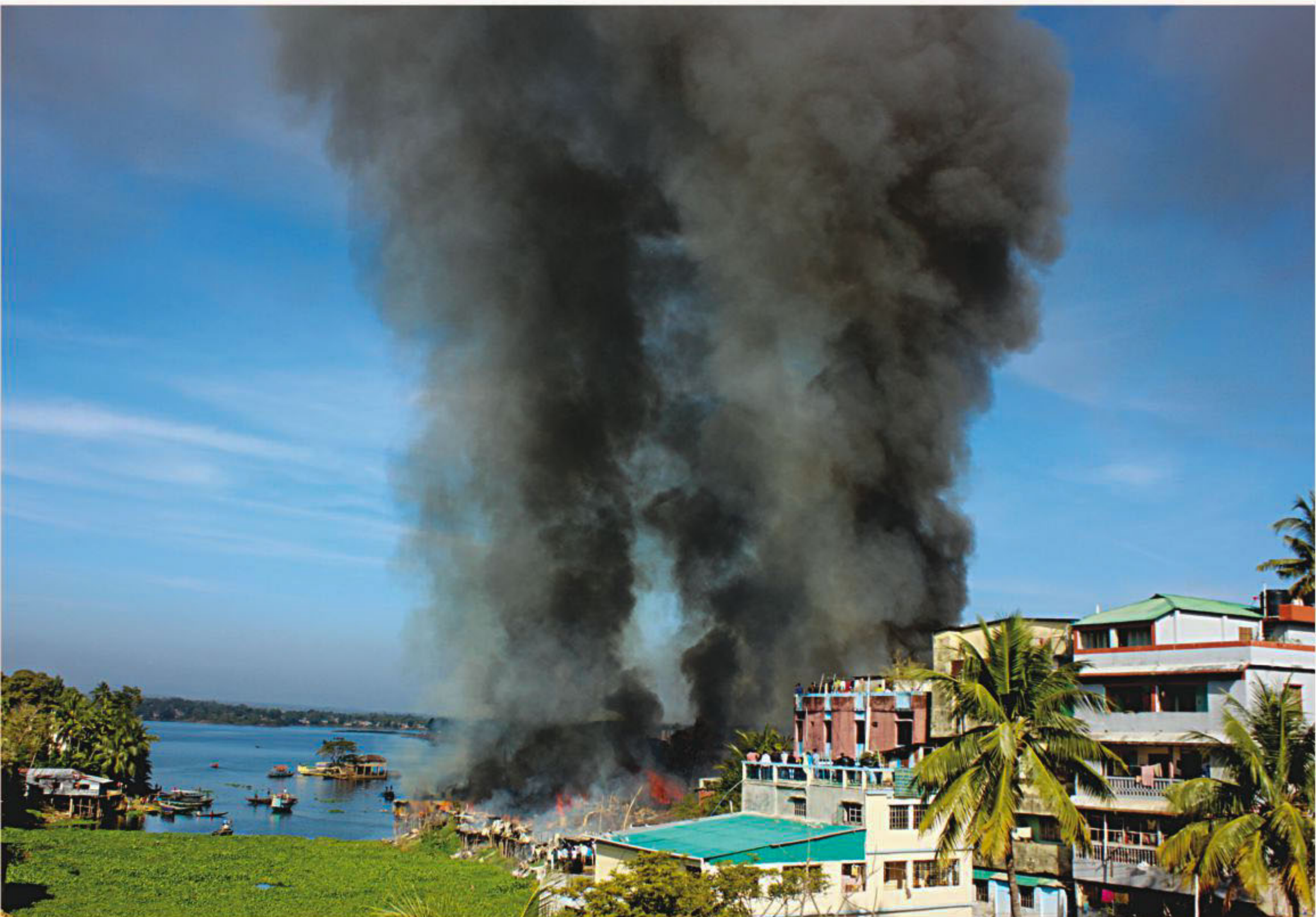
Plumes of smoke billowing from a fire in Masjid Colony area of Rangamati town yesterday. The fire burned 73 homes in the area. No injuries were reported. Story on page 2.