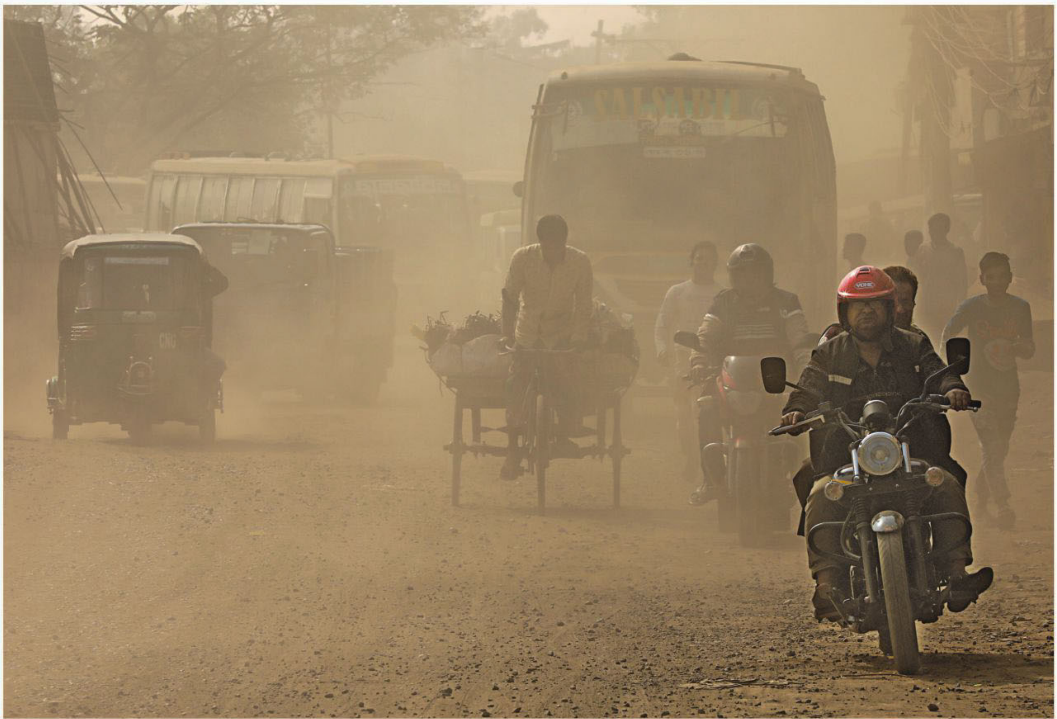
Thanks to construction projects, a thick cloud of dust reduces visibility even in broad daylight yesterday on Dhaka-Mawa road in the capital's Jurain area.