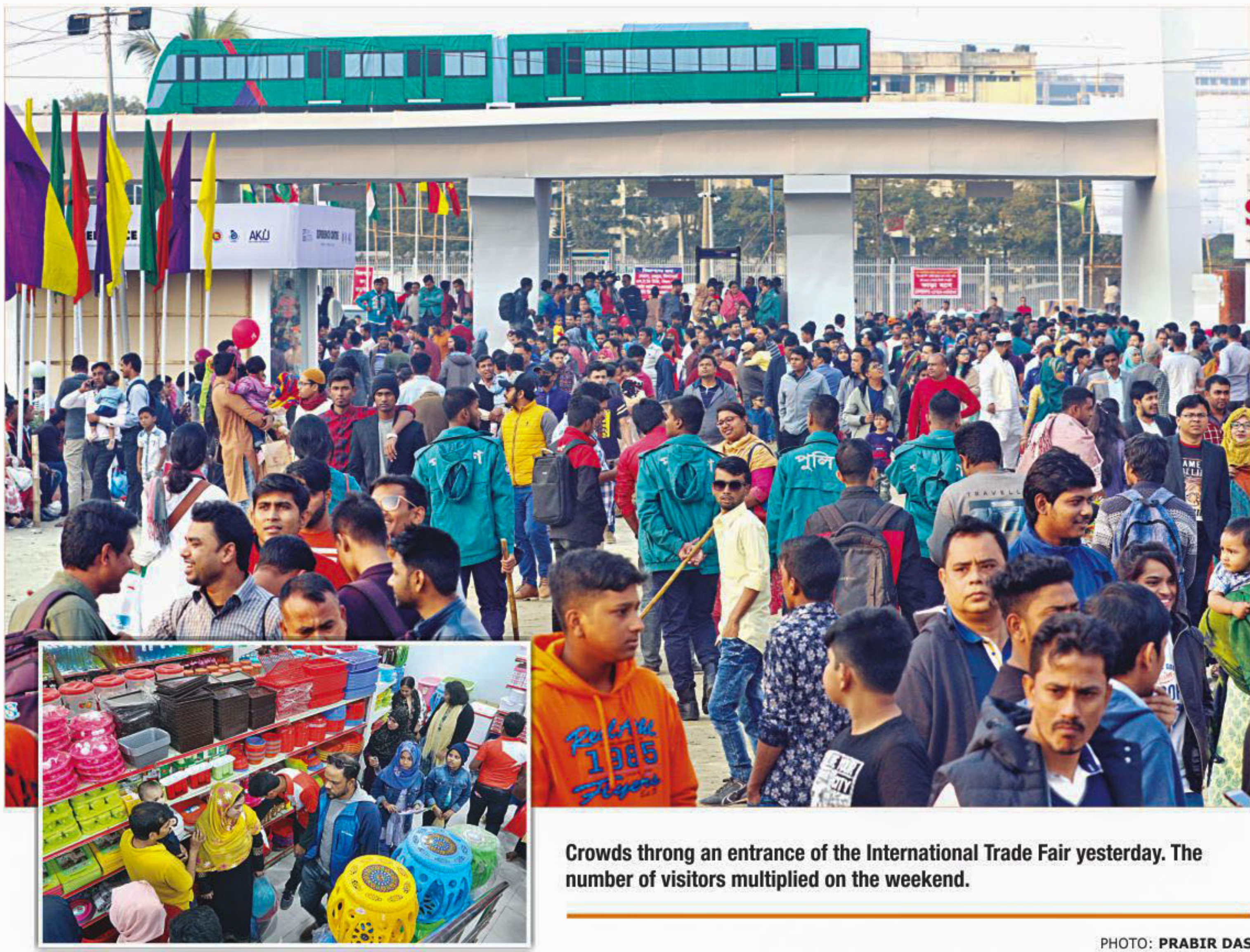
Crowds throng an entrance of the International Trade Fair yesterday. The number of visitors multiplied on the weekend.