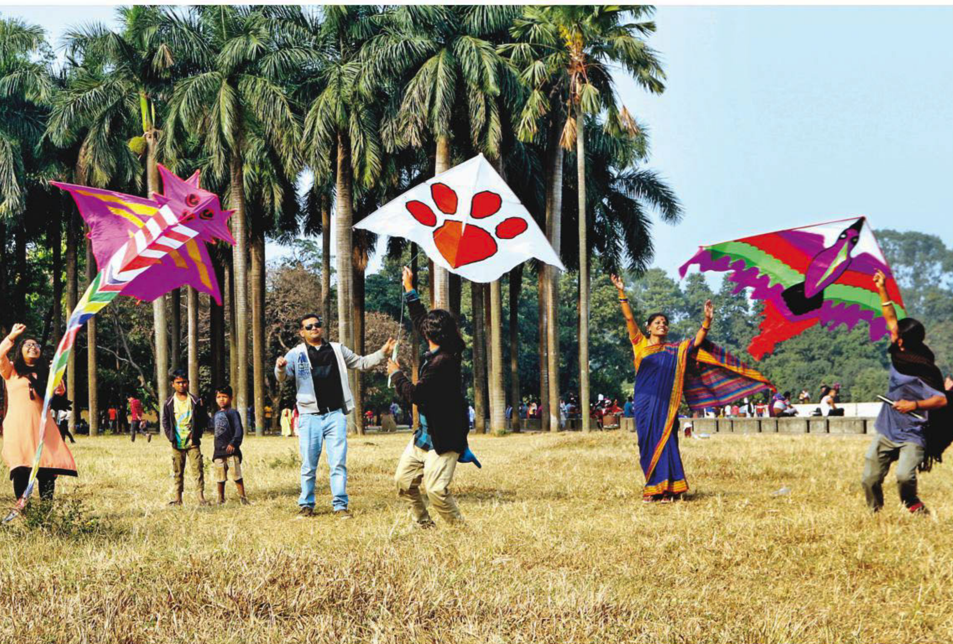
RELIVING CHILDHOOD MEMORIES... People of all ages enjoy a day of flying kites at Suhrawardy Udyan in Dhaka yesterday, as part of a "Ghuri Utsab" (kite festival), organised by "Gagan".