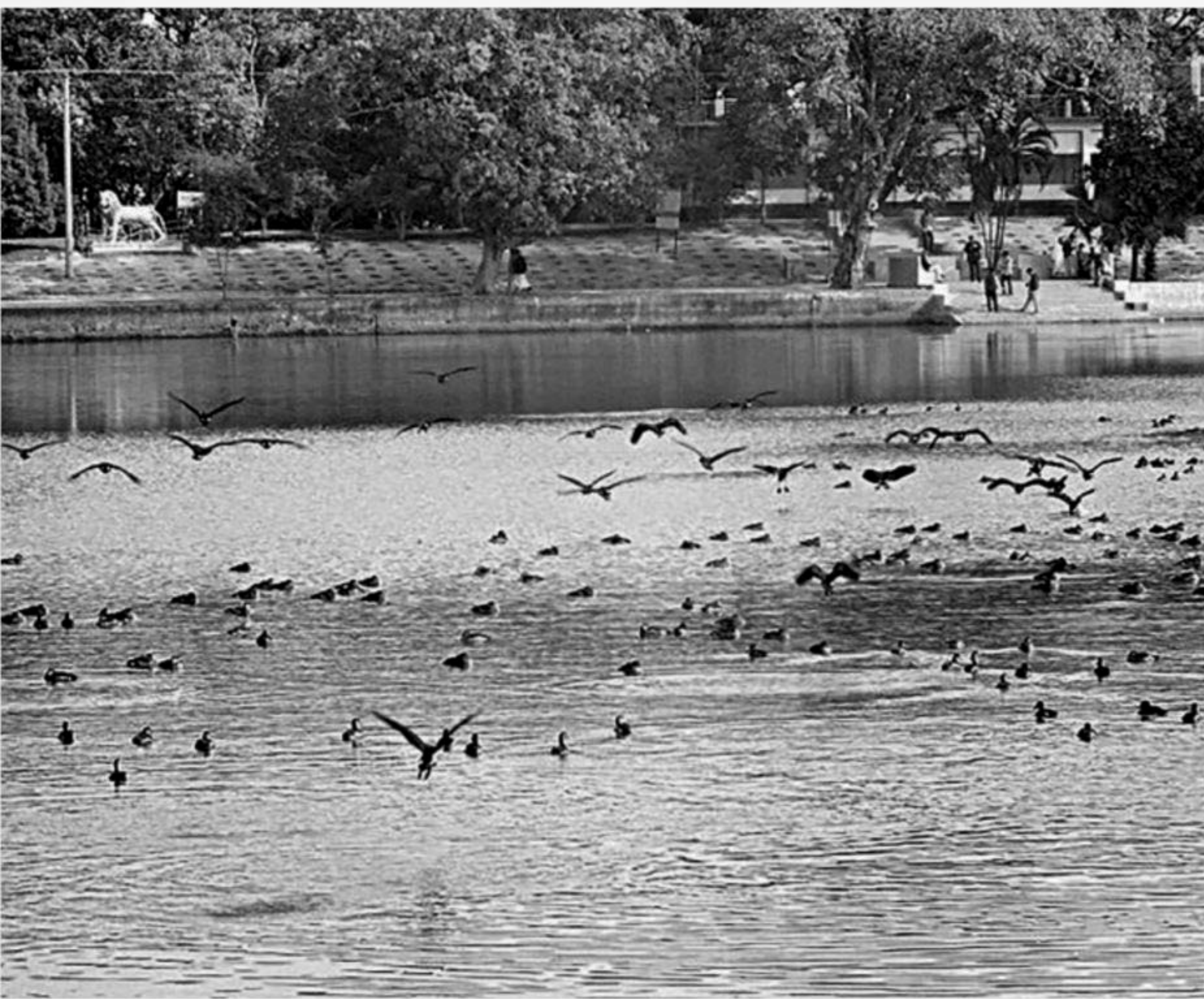
Flocks of migratory birds flutter over Nilsagar, a vast water body covering 54 acres of land, at Dhobadanga village in Nilphamari Sadar upazila.