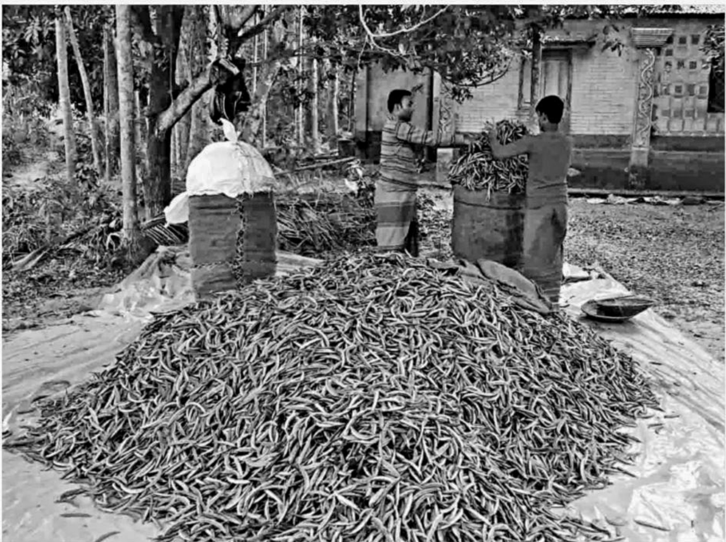
Farmers of Shaildubi village in Faridpur's Sadarpur upazila fill sacks with beans for sale at the local market.

Grower Abdur Razzak Karim of Charnasirpur village said they can collect bean after 45 days during cultivation. Many farmers of their area got solvency by cultivating bean.