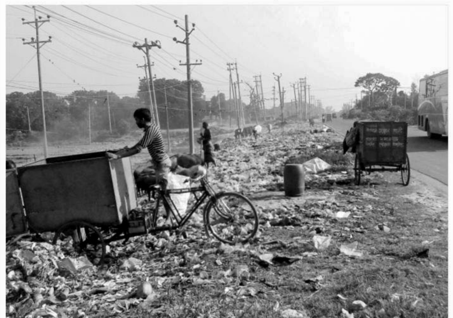
Garbage being dumped beside an important road in Tangail town, causing environment pollution and sufferings to locals as well as commuters.

He also said he will take necessary steps so that bodies of died animals are not dumped on roadsides and the garbage cannot spread on the road.