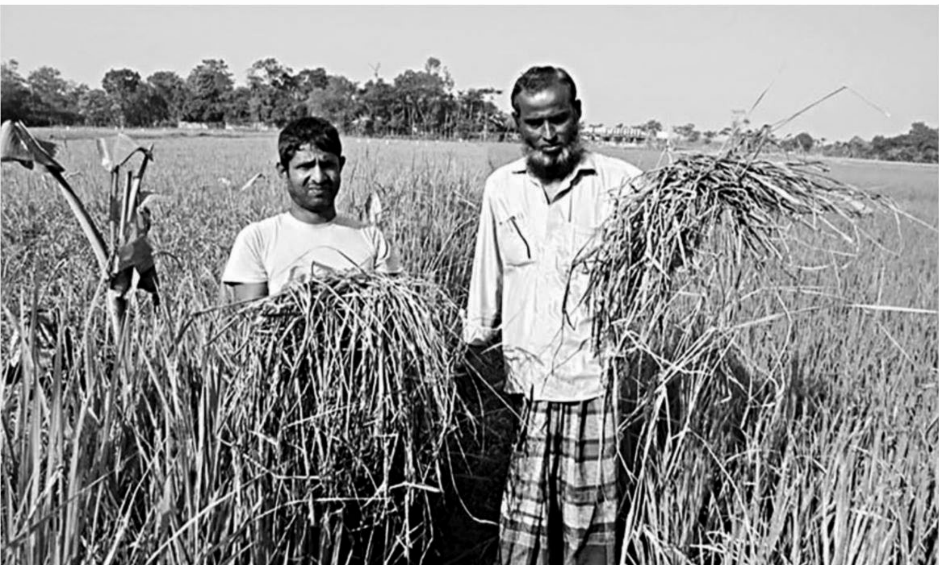
Worried farmers hold paddy destroyed by rats in Islampur union under Sadar upazila in Sunamganj Haor area.