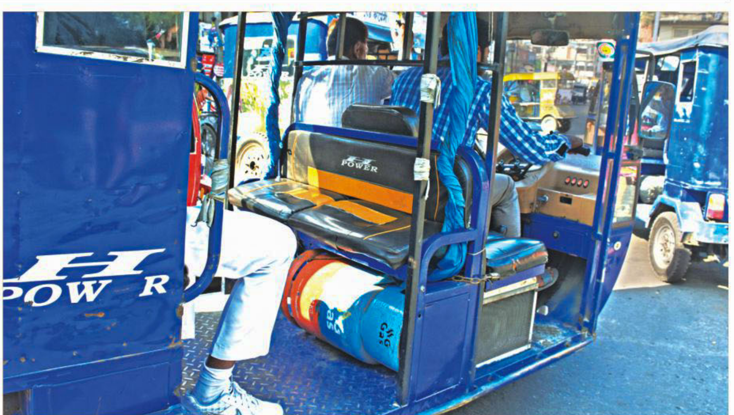
A three-wheeler running on gas in Barishal city yesterday. A few hundred of these vehicles are on the city streets using gas cylinders meant for household use. While cylinder explosion often happens at home due to unsafe use, it is anybody's guess how risky it is for motor vehicles.