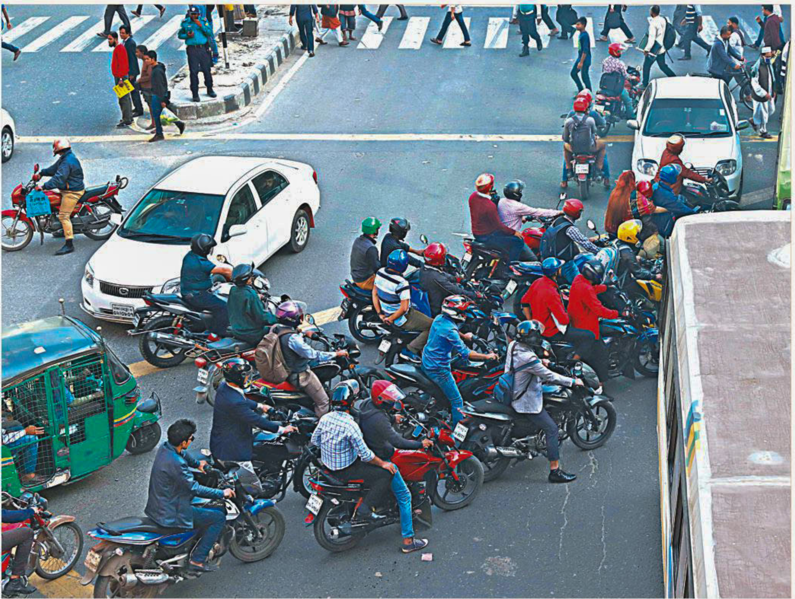
Dhaka city traffic remains extremely chaotic as before although a road safety movement swept the country last year, highlighting how important it is to bring discipline in the transport sector. Ignoring any signal, dozens of motorbikes swarm across Bangla Motor intersection yesterday. Some of the motorcycles even stop in front of a row of cars at the centre of the intersection. In the same area, a CNG-run auto-rickshaw, apparently in a desperate move to save time, gets stuck between two buses.