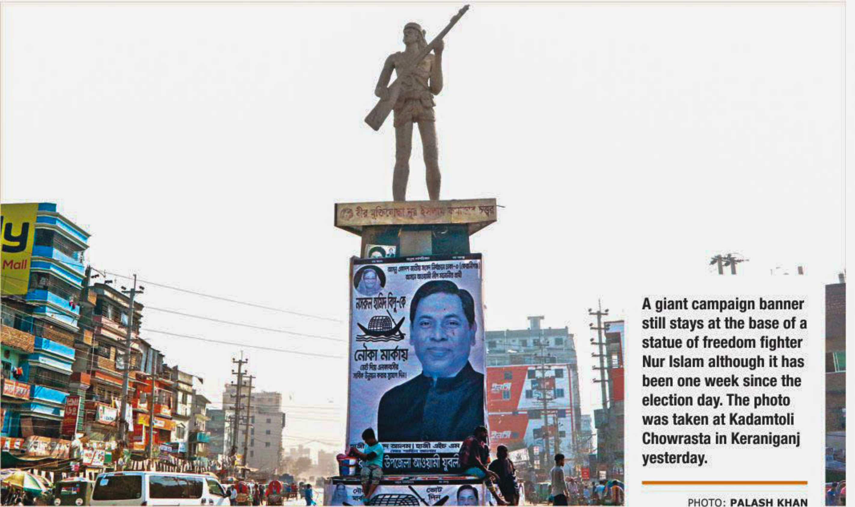
A giant campaign banner still stays at the base of a statue of freedom fighter Nur Islam although it has been one week since the election day. The photo was taken at Kadamtoli Chowrasta in Keraniganj yesterday.