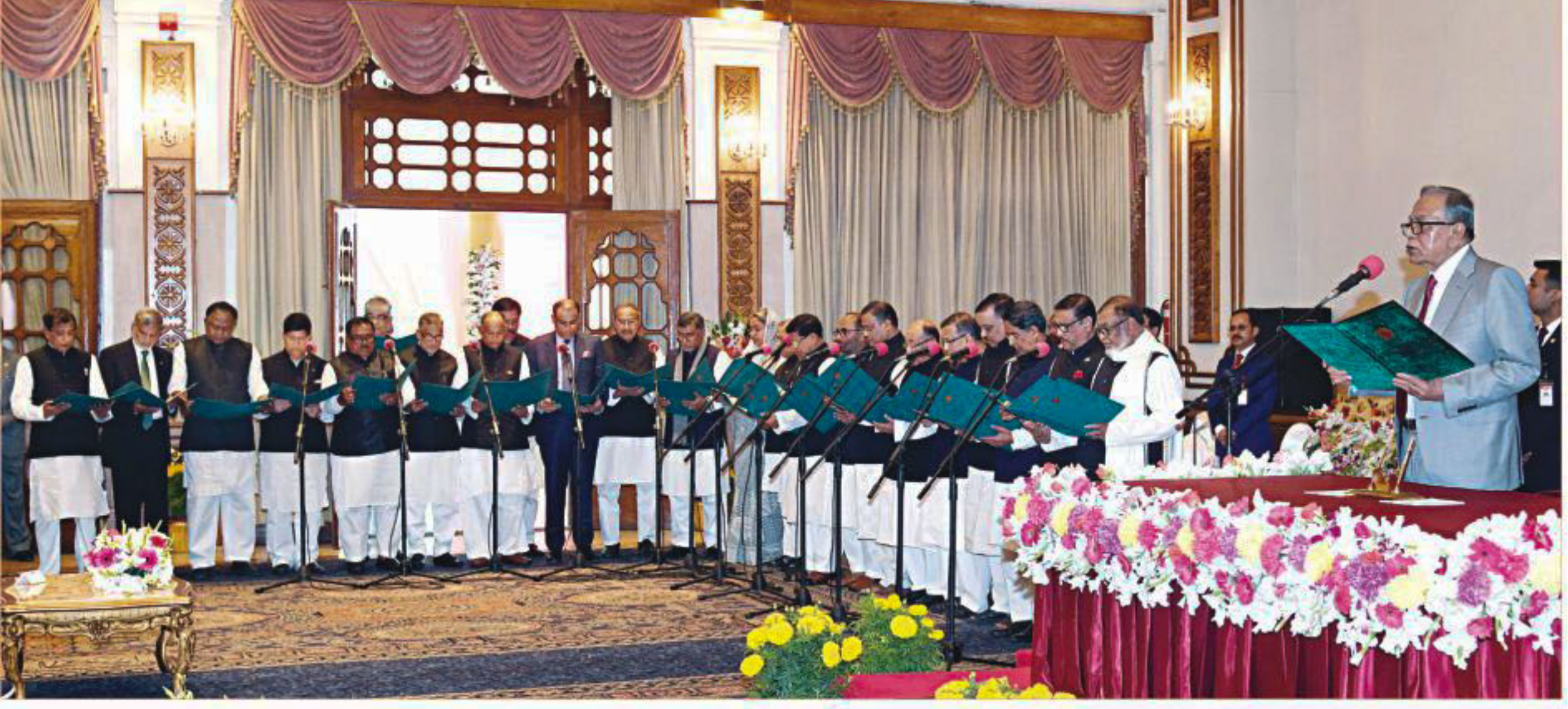
President Abdul Hamid is administering oath to the ministers and state ministers, right, of the Sheikh Hasina-led 47-member cabinet at the Bangabhaban yesterday.