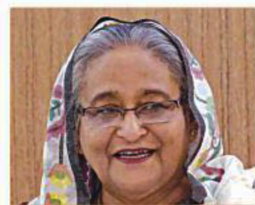
SHEIKH HASINA Gopalganj-3 Prime Minister 7.68 cr

The Daily Star's Sohel Parvez and Jahurul Islam Sojol with the help of a few others have made an effort to analyse the affidavits submitted by the candidates, running in the 11th parliamentary polls, to the Election Commission. Today we are publishing the data of gross wealth of those who were made ministers, state ministers and deputy ministers (excluding three technocrat ministers). The gross wealth of them and their spouses and other dependents was calculated based on the value of their movable and immovable properties mentioned in the affidavits.