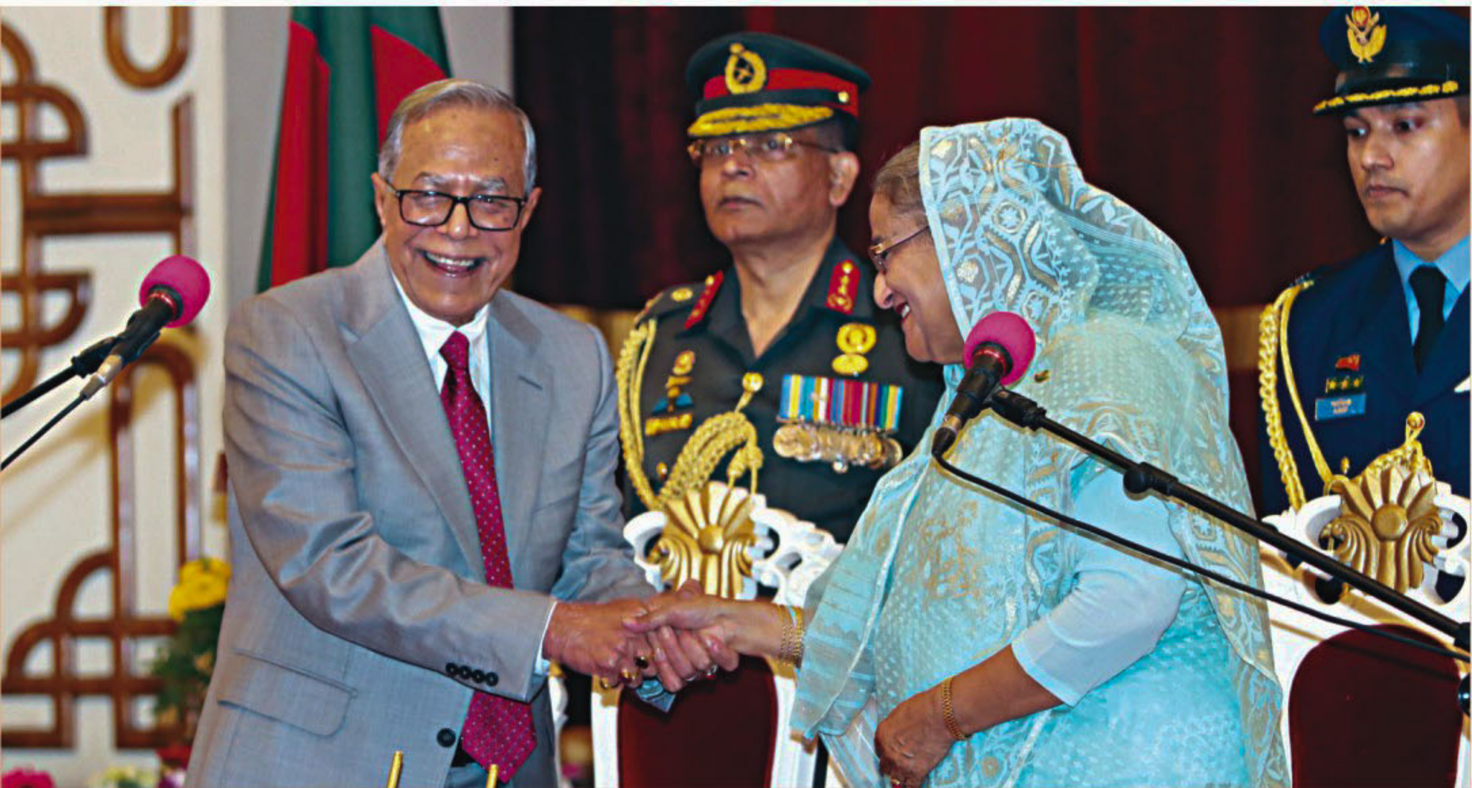
President Abdul Hamid congratulates Prime Minister Sheikh Hasina at the Bangabhaban yesterday after she is sworn in for the third consecutive term.