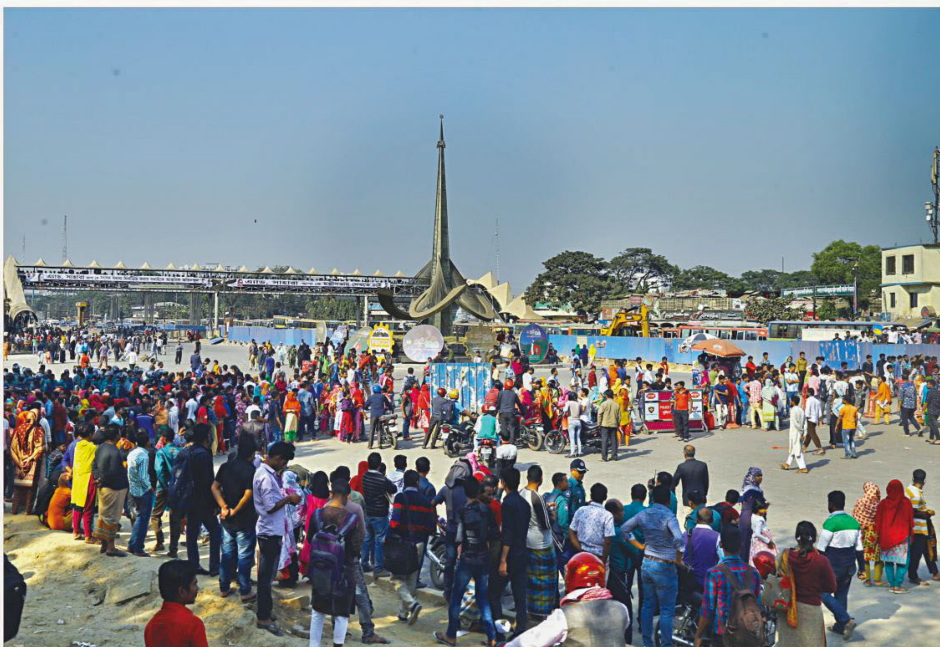
Garment workers block a portion of Dhaka-Mymensingh highway in the city's Uttara as they demonstrate against major disparity in wage hikes in their pay scale grades.

Passengers heading towards Mymensingh, Netrakona, SEE PAGE 11 COL 2