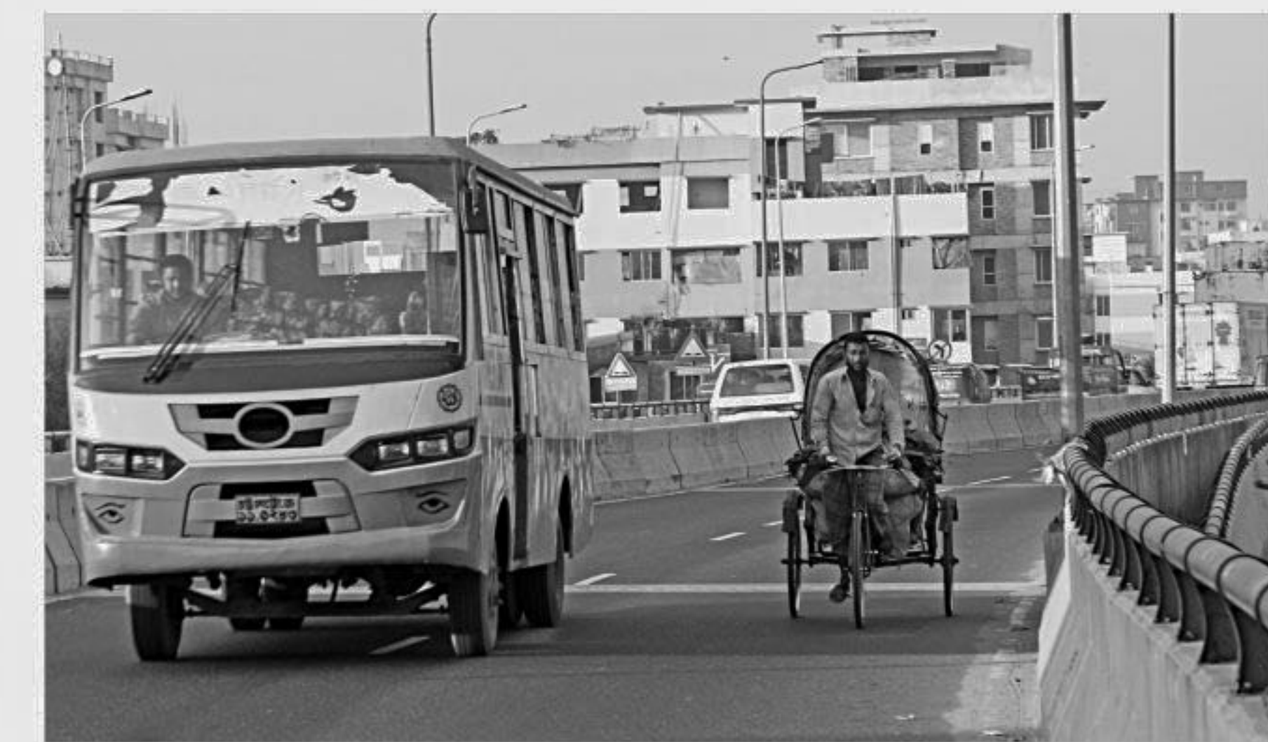
A rickshaw on Akhtaruzzaman Flyover in Chattogram city yesterday. While it is illegal for this non-motorised, slow-moving vehicle to use flyovers, many may keep wondering how this rickshaw-puller got there in the first place.