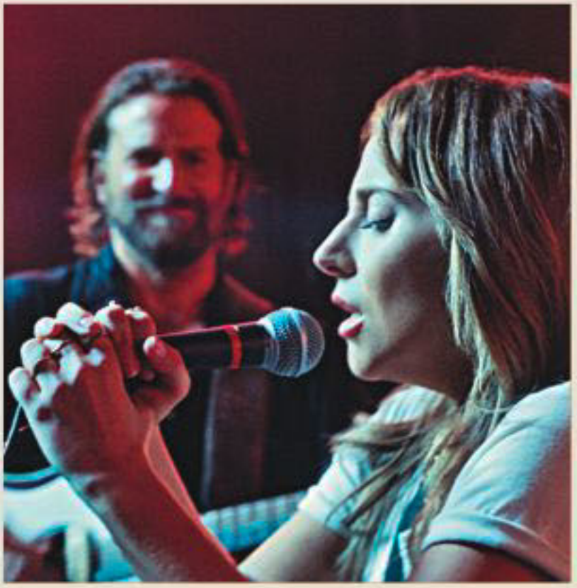
A Star is Born

may stand out in the Best Motion Picture Comedy or Musical category. Even though Bohemian Rhapsody was torn apart by critics, the viewers loved it, and it went on to become a surefire blockbuster. Admittedly, Rami Malek, in the role of Freddie Mercury, gave one of the best performances we have seen in recent years. He did a great job capturing the aura and flamboyance of the iconic musician. Meanwhile, no one in recent memory has had a dynamite film debut – in a leading role, nonetheless – quite like Lady Gaga, who was