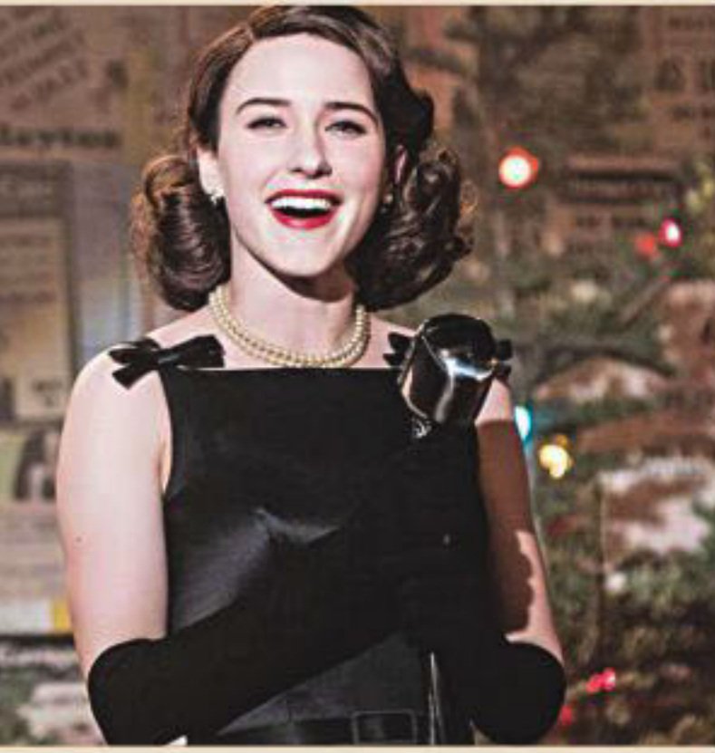
The Marvelous Mrs Maisel

The Golden Globes, an event that celebrates the best in film and television in Hollywood, is a show movie lovers and TV buffs look forward to every year. Overseen by the Hollywood Foreign Press Association, The Golden Globes often delivers some unexpected winners that do not always line up with the Oscars or the Emmys. This is why the programme is fun to watch—and even more difficult to predict. We present you with a list of nominees who we hope will take the trophies home at The Golden Globes 2019. While Black Panther will most certainly be nominated for Best Picture at this year's Academy Awards, we doubt the film will win. But the Golden Globes is known for taking the unconventional route, so, the jury may just hand the top prize over to one of the best Marvel movies ever made and a true Hollywood game changer. Along with Black Panther , Crazy Rich Asians was another big moment for representation in the world of cinema this year—and it played a role in reigniting the romantic comedy genre in 2018. We think it