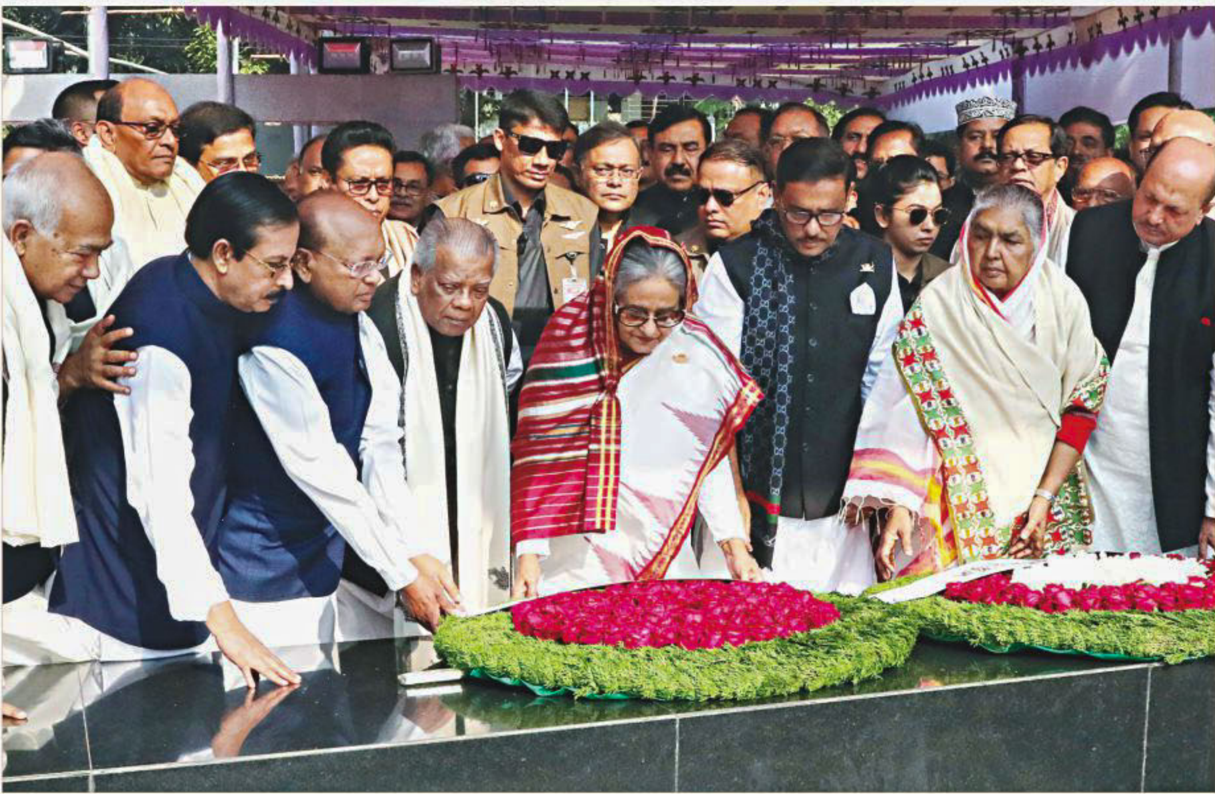
Flanked by newly-elected Awami League lawmakers, party President Sheikh Hasina places a wreath at the portrait of Father of the Nation Bangabandhu Sheikh Mujibur Rahman in front of Bangabandhu Memorial Museum in the city's Dhanmondi yesterday.