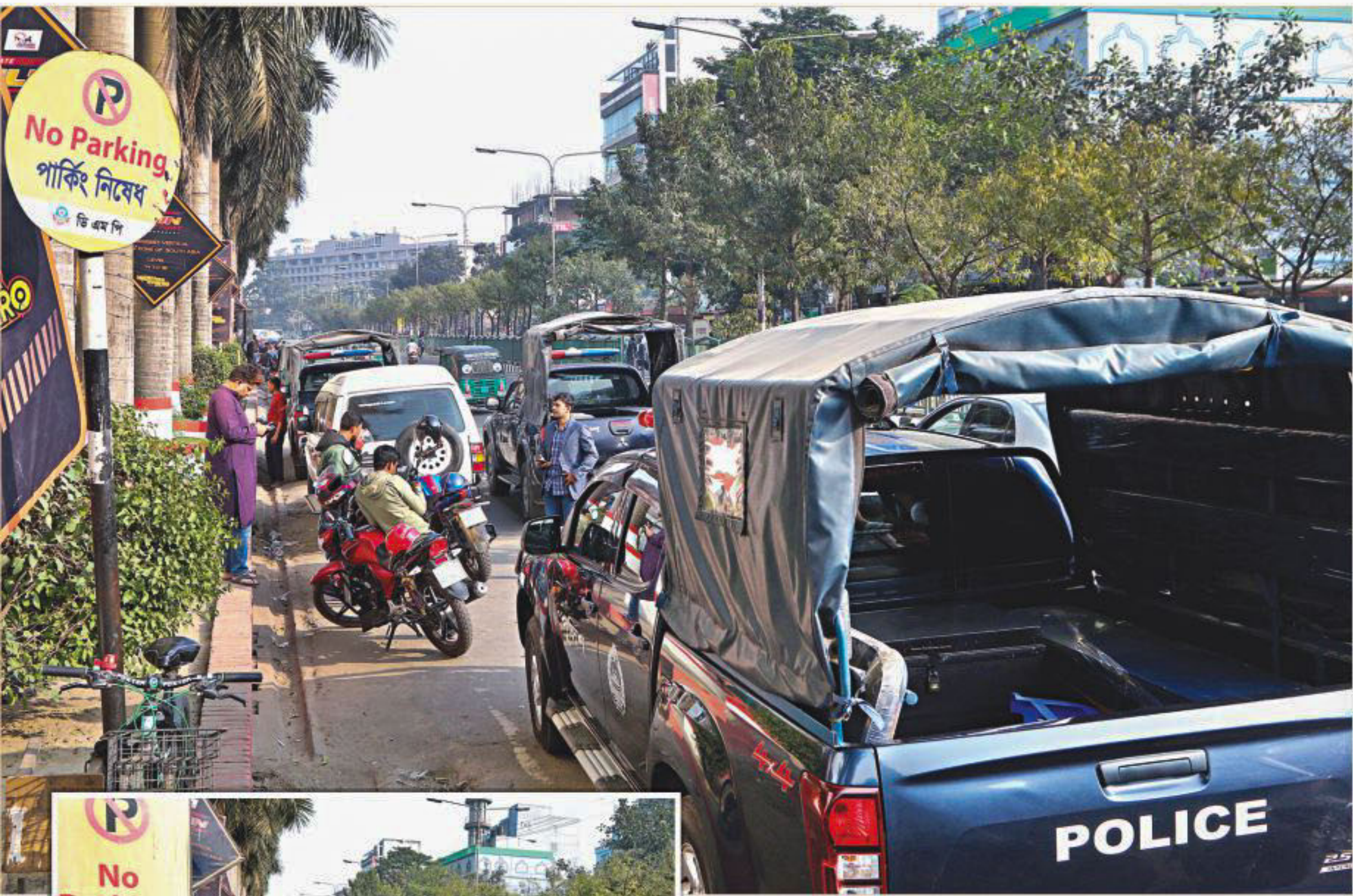
Defying a sign forbidding parking, vehicles including police pickups have been parked on a road in front of the city's Bashundhara City shopping mall yesterday. Such illegal parking often causes traffic jams.