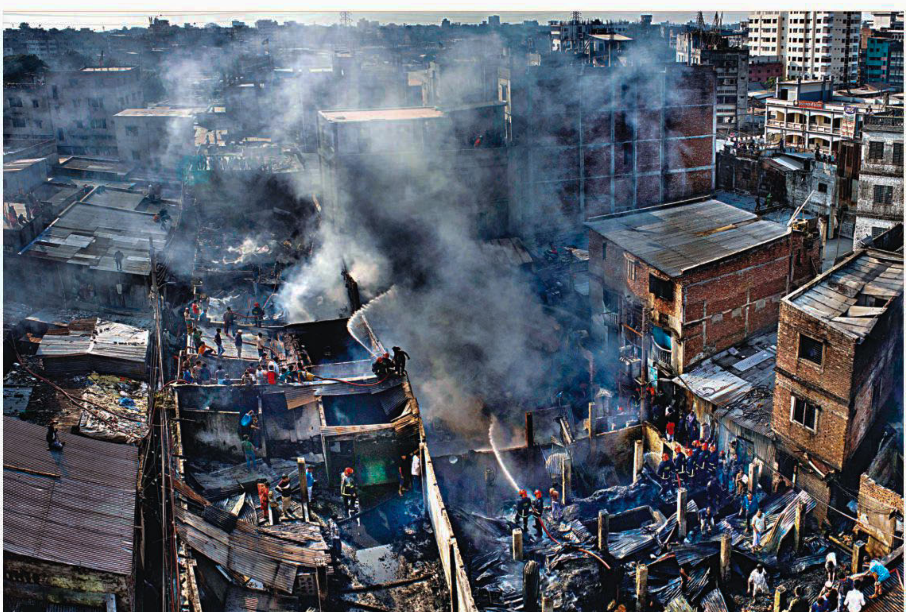
Firefighters spray water as thick smoke billows from a plastic factory in Islambagh area of Old Dhaka around 12:40pm yesterday.