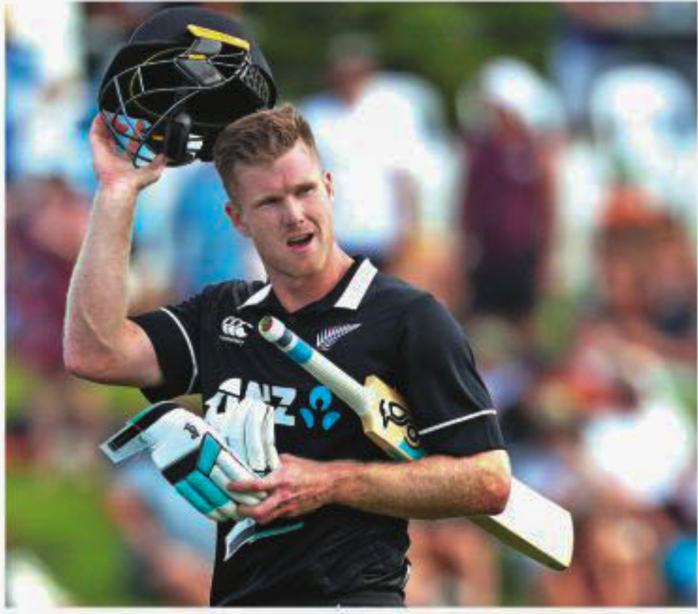
New Zealand's James Neesham hit a 13-ball 47 after Martin Guptill's ton in the first ODI against Sri Lanka in Tauranga yesterday.