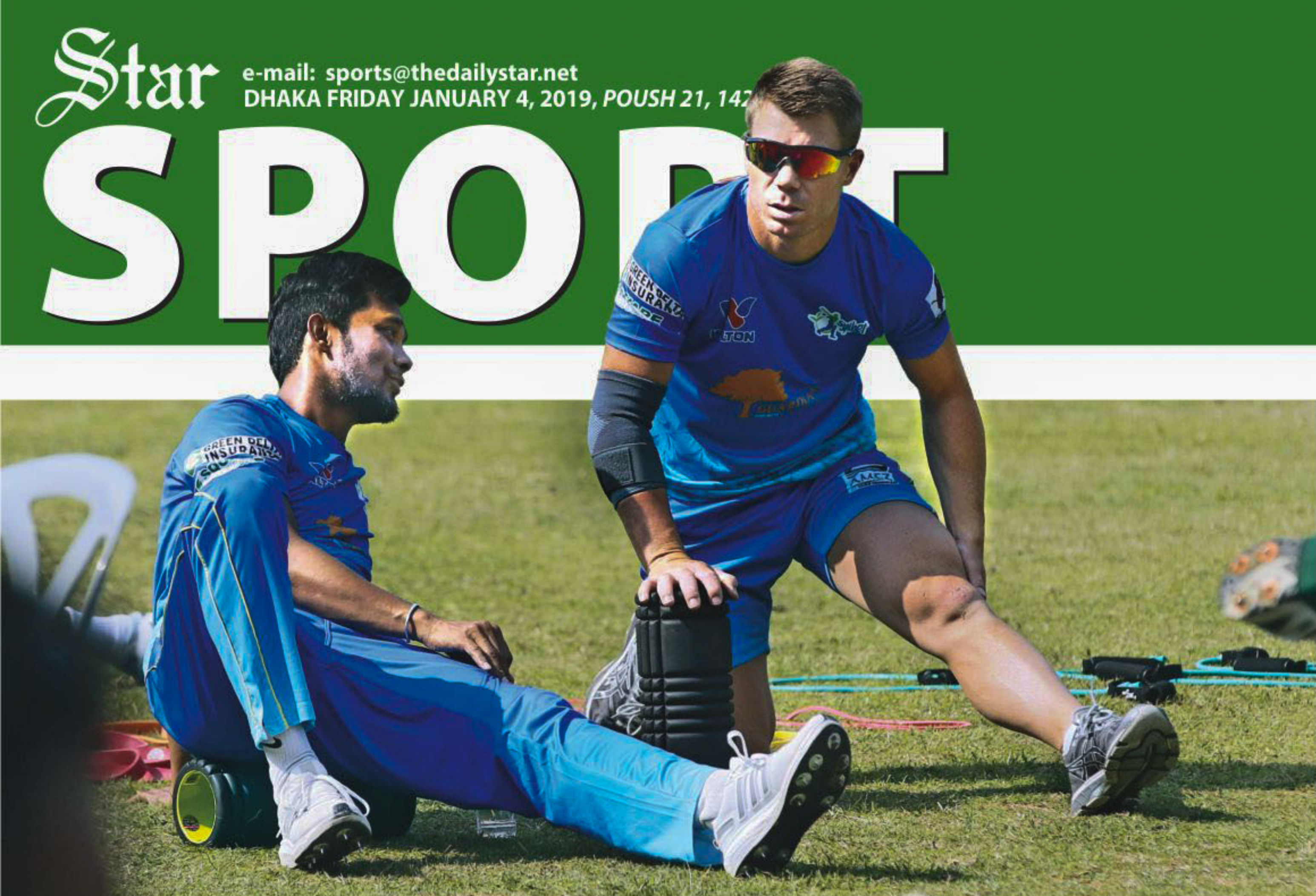
Sabbir Rahman (L) and former Australia vice-captain David Warner might both be talented cricketers but due to their respective bans from international cricket the two must make the most of their time with BPL franchise Sylhet Sixers when the tournament gets underway tomorrow.