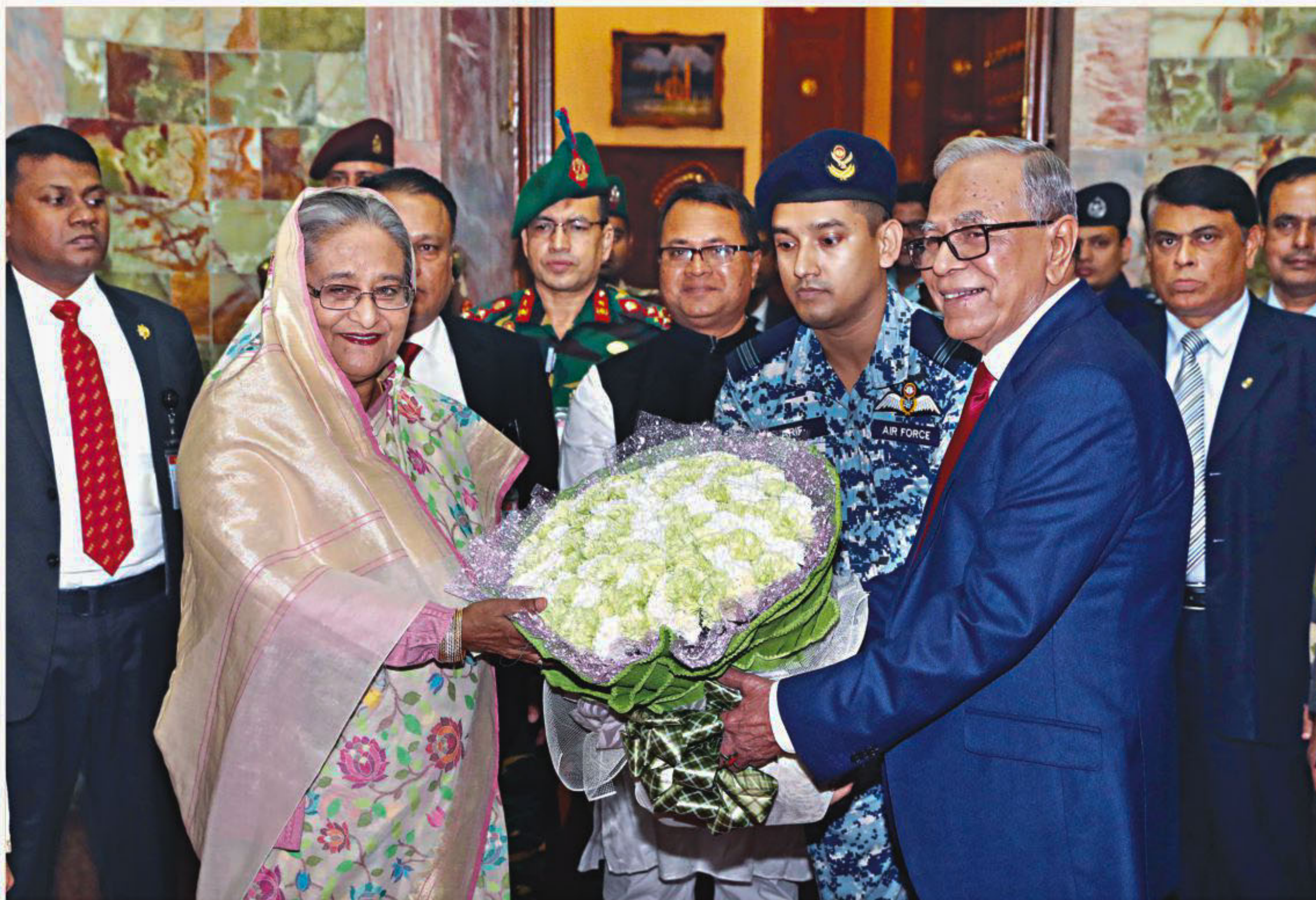
President Abdul Hamid greets Prime Minister Sheikh Hasina with a bouquet as she calls on him at the Bangabhaban yesterday.