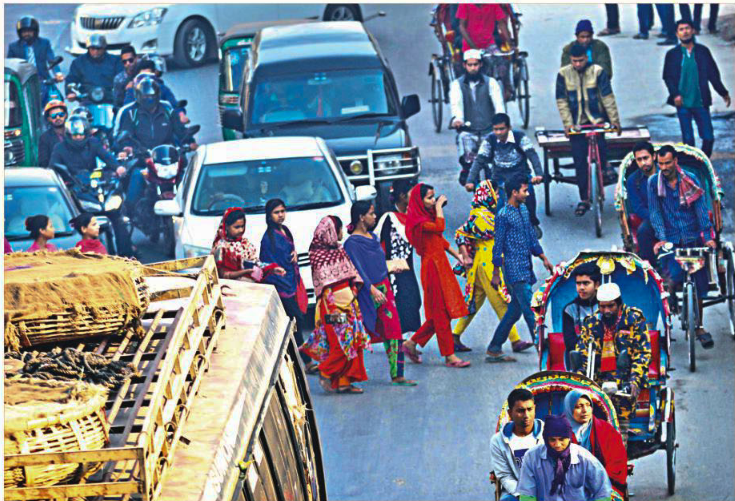
A day after two girls were run over and killed by a bus, people continue to jaywalk at the same place yesterday even though there is a footbridge nearby. The photo was taken near Abul Hotel on DIT Road.