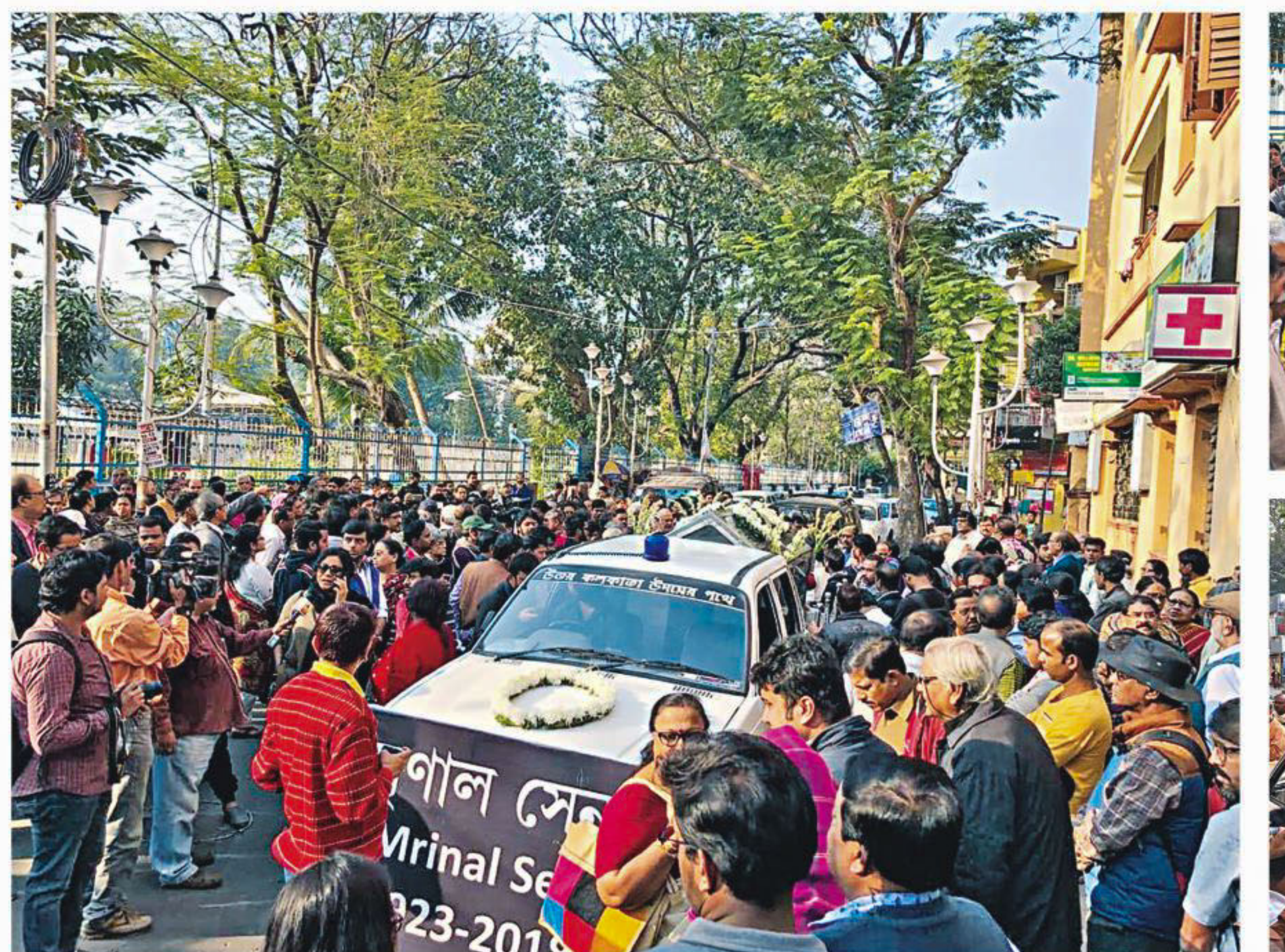
A farewell procession from Desho Priyo Park, for legendary director Mrinal Sen, took place in Kolkata yesterday. People from all walks of life, including friends and well-wishers from the film fraternity joined in to say farewell to one of the iconic figures in Bengali filmmaking.

Last year, the Jaya Ahsan starrer Debi , the film adaptation of renowned author Humayun Ahmed's novel of the same name, opened to rave reviews from the critics and audience alike. The film marked Jaya's debut into the field of production. After the spectacular success of Debi , the actor has her eyes set on her upcoming film, Phurut .