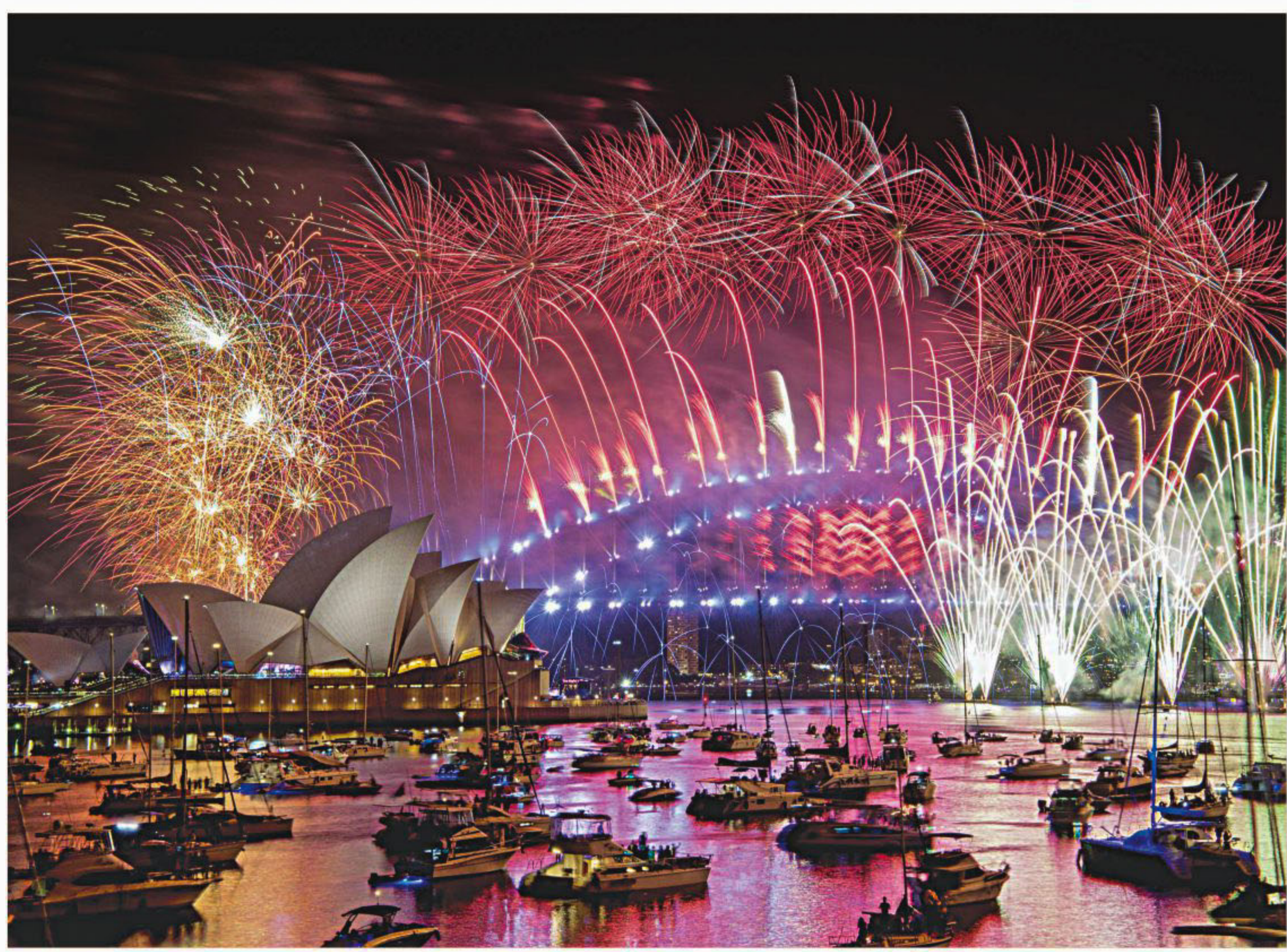
Fireworks explode over the Sydney Harbour during New Year's Eve celebrations in Sydney, Australia, early today.