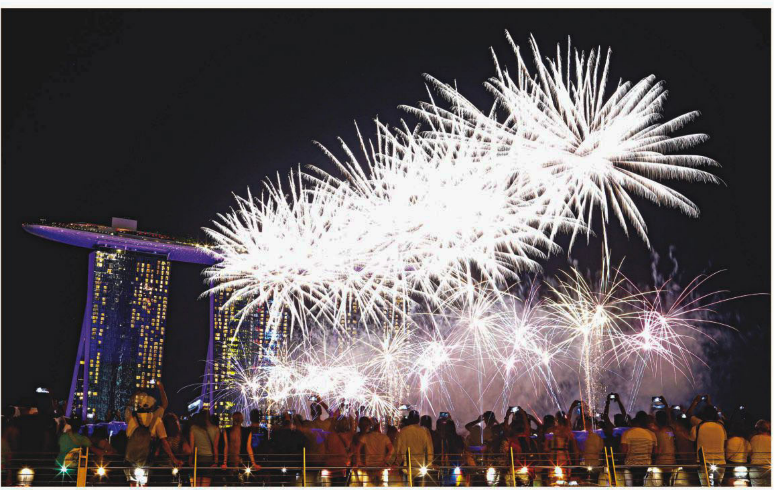
WELCOME 2019 | Fireworks explode over the Marina Bay during New Year festivities in Singapore early today. As the world parties, many will also look forward to 2019 and wonder whether the turmoil witnessed during the previous year will spill over into the next.

Reveals new CCTV footage AFP, Ankara A Turkish television station has broadcast CCTV footage showing men carrying cases and bags which it says contained slain Saudi journalist Jamal Khashoggi's body parts.