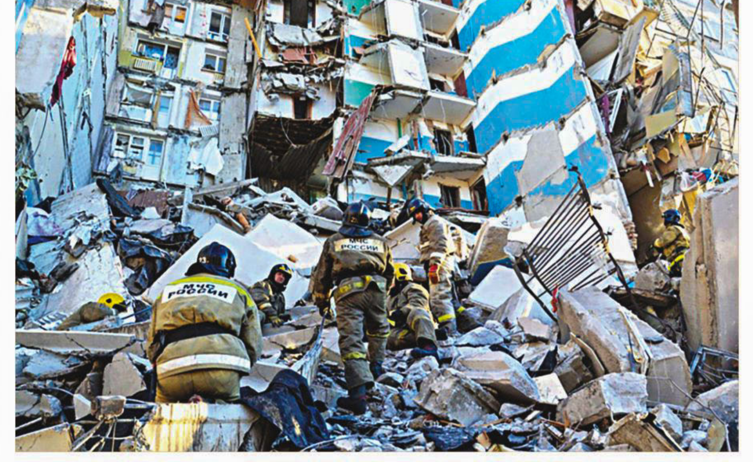
Emergency personnel work at the site of collapsed apartment building after a suspected gas blast in Magnitogorsk, Russia yesterday. Four people were killed and nearly 70 unaccounted for after the explosion rocked the high-rise building, leaving hundreds without a home in freezing temperatures on New Year's Eve.

REUTERS, Berlin Acknowledging that her government disappointed many Germans in 2018, Chancellor Angela Merkel sought to pull the country together for 2019 with a call for solidarity and cooperation to overcome deep political divisions.