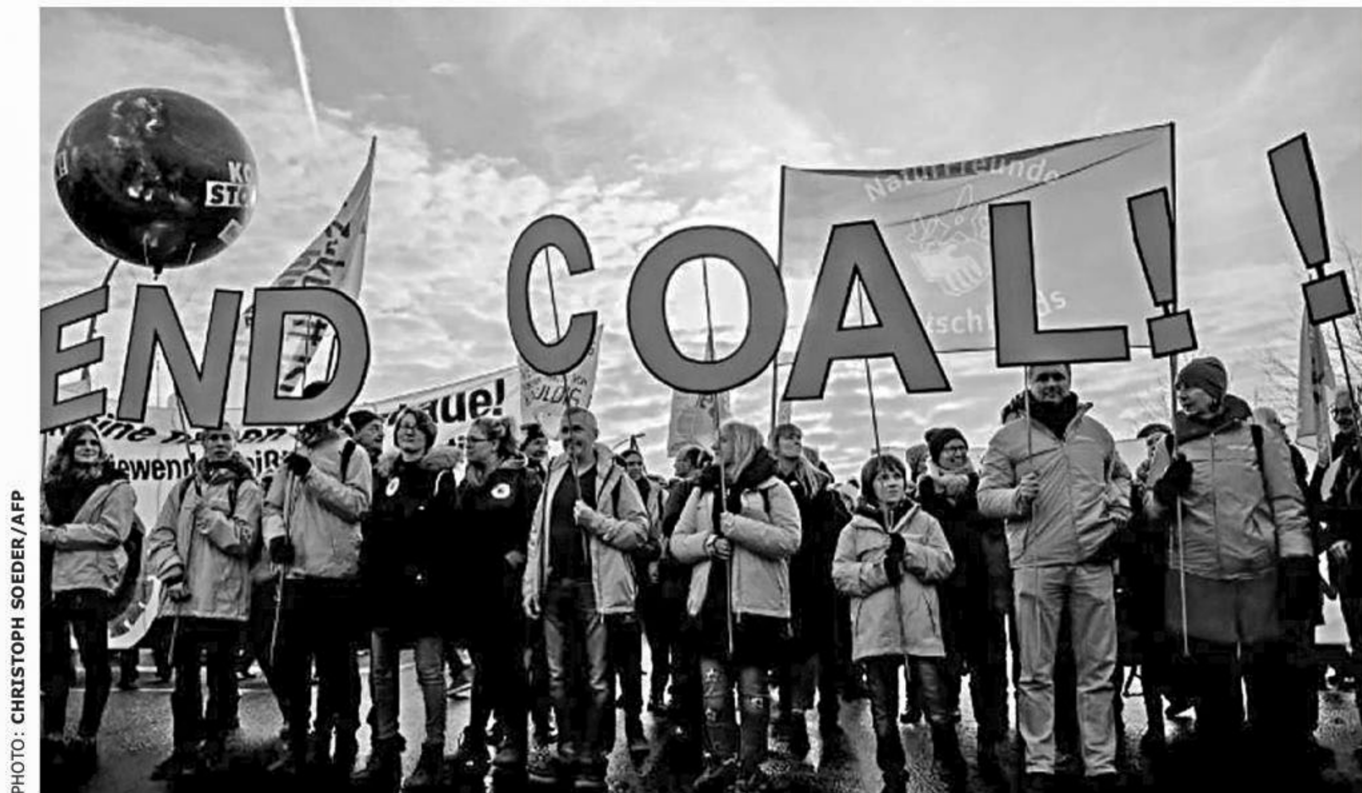
Climate change activists gather in Berlin, Germany on December 1, 2018 to protest against the use of coal.