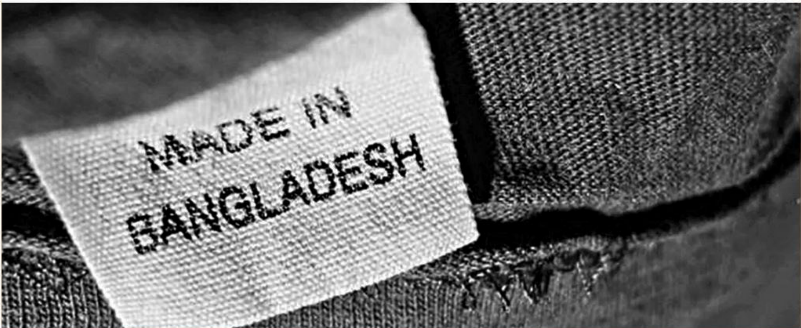
The RMG sector will have to negotiate better prices from buyers, without which, the expensive upgrades are not going to pan out.