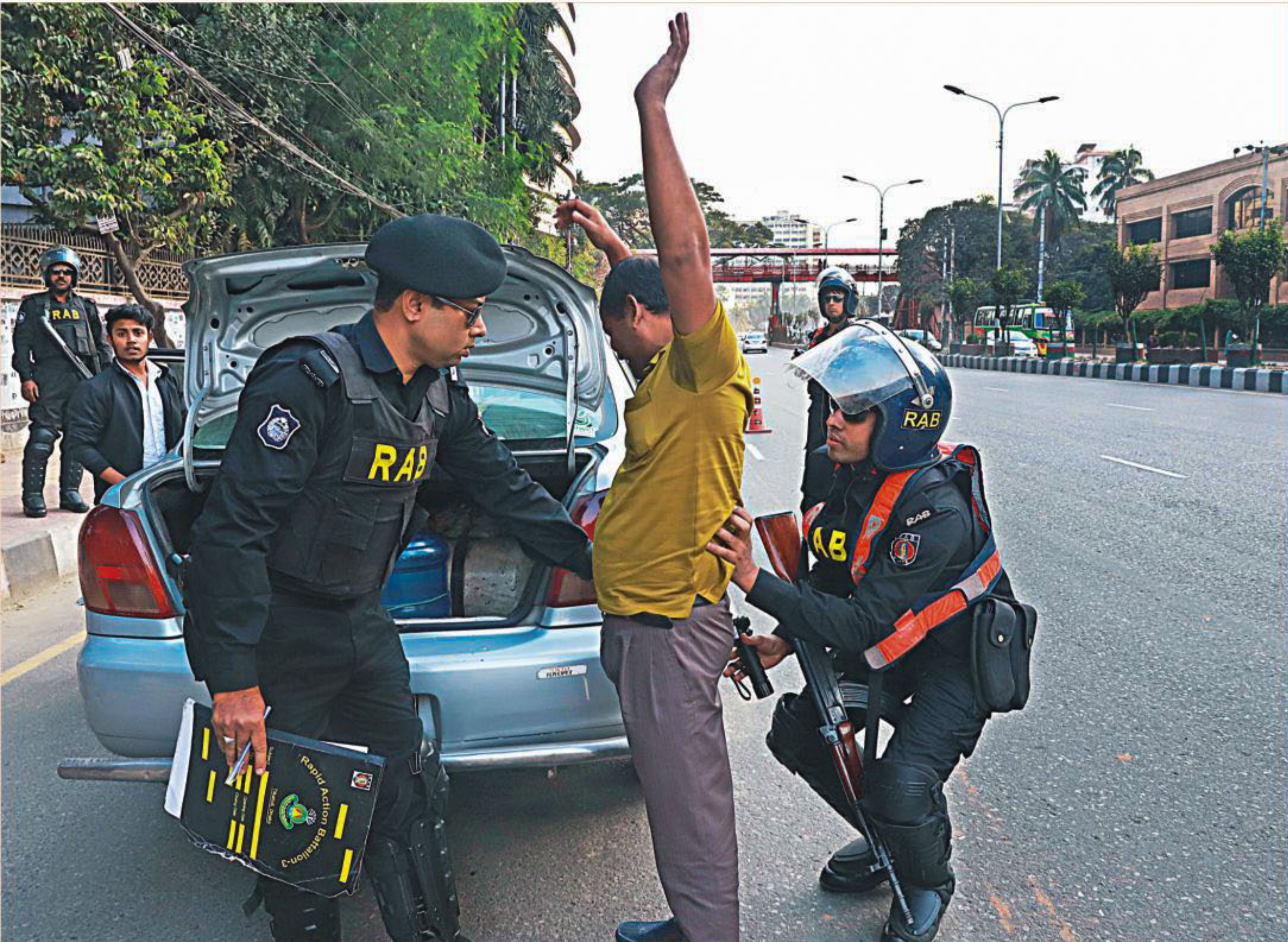
A LACKLUSTRE NEW YEAR'S EVE... While the rest of the world was ready to welcome the New Year in festivity, residents of Dhaka had restrictions on celebrations and security checks to look forward to. Sometimes December 31 is duller than a typical day in the city as shown by the absence of a crowd at the otherwise busy Bashundhara Shopping Complex and an almost traffic-free Kazi Nazrul Islam Avenue.

Weather may remain dry with temporary partly cloudy sky over the country in next 24 hours till 6:00pm today, UNB said quoting the Met office. Severe cold wave is sweeping over Panchagarh district. Mild to moderate cold wave is sweeping over Mymensingh divisions and parts of Rangpur division. The sun sets in the capital