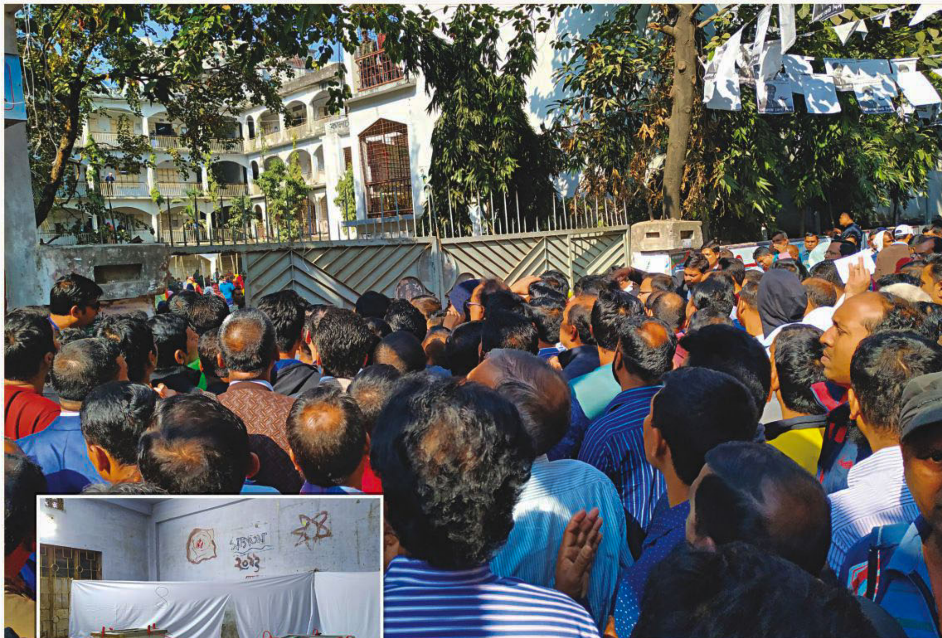
Voters gather at the closed gate of Kalachandpur High School and College and Kalachandpur Primary School polling centres around 10:00am yesterday while the polling booths, inset, inside are devoid of voters.