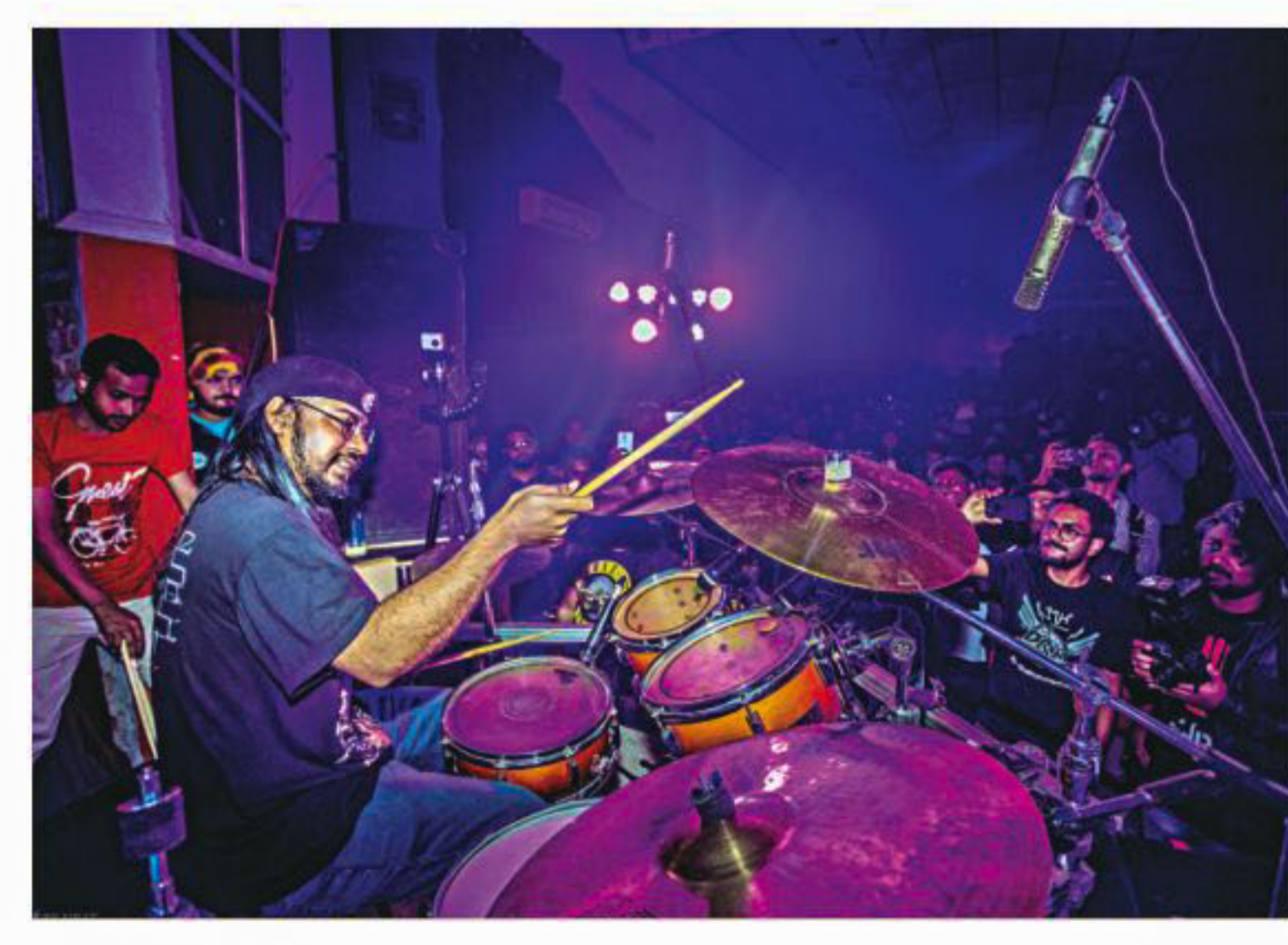
Bangladesh Drum Day celebrated the best of drumming that the country has produced over the years.