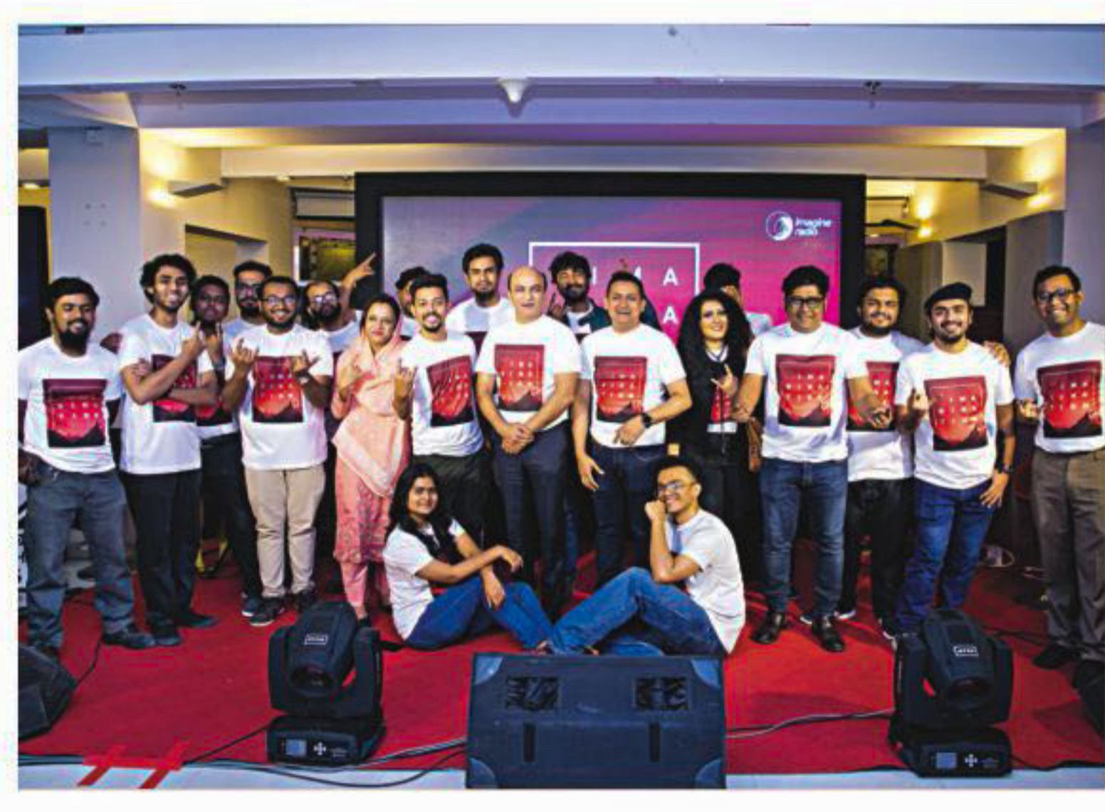
Imagine Radio, a music streaming app, launched with endorsement from the music industry.