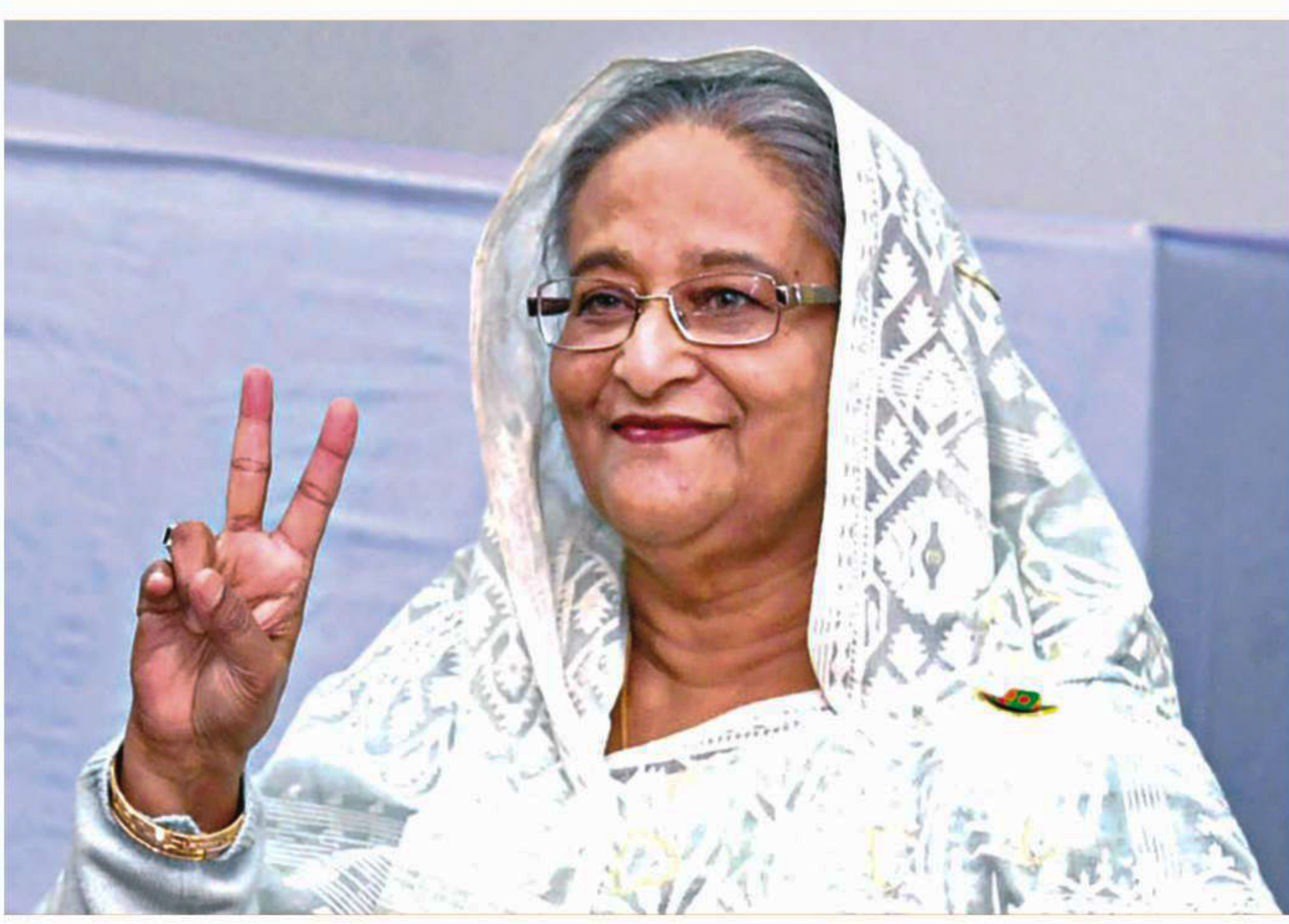
Prime Minister Sheikh Hasina flashes V-sign after casting her vote at Dhaka City College centre yesterday.