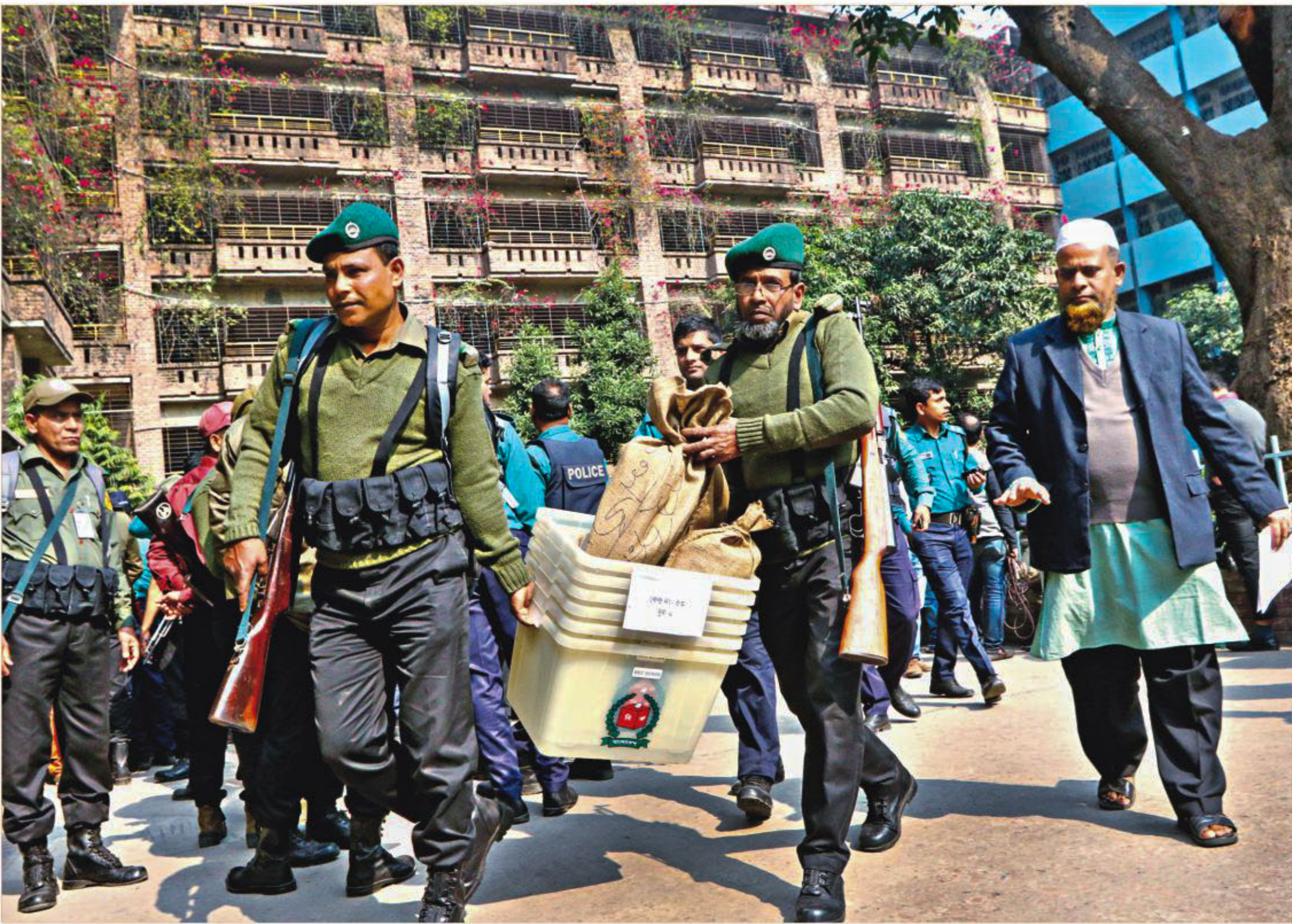
Law enforcers carrying voting materials inside Willes Little Flower School in the capital's Kakrail yesterday. The school is one of the polling centres for the 11th parliamentary election today.