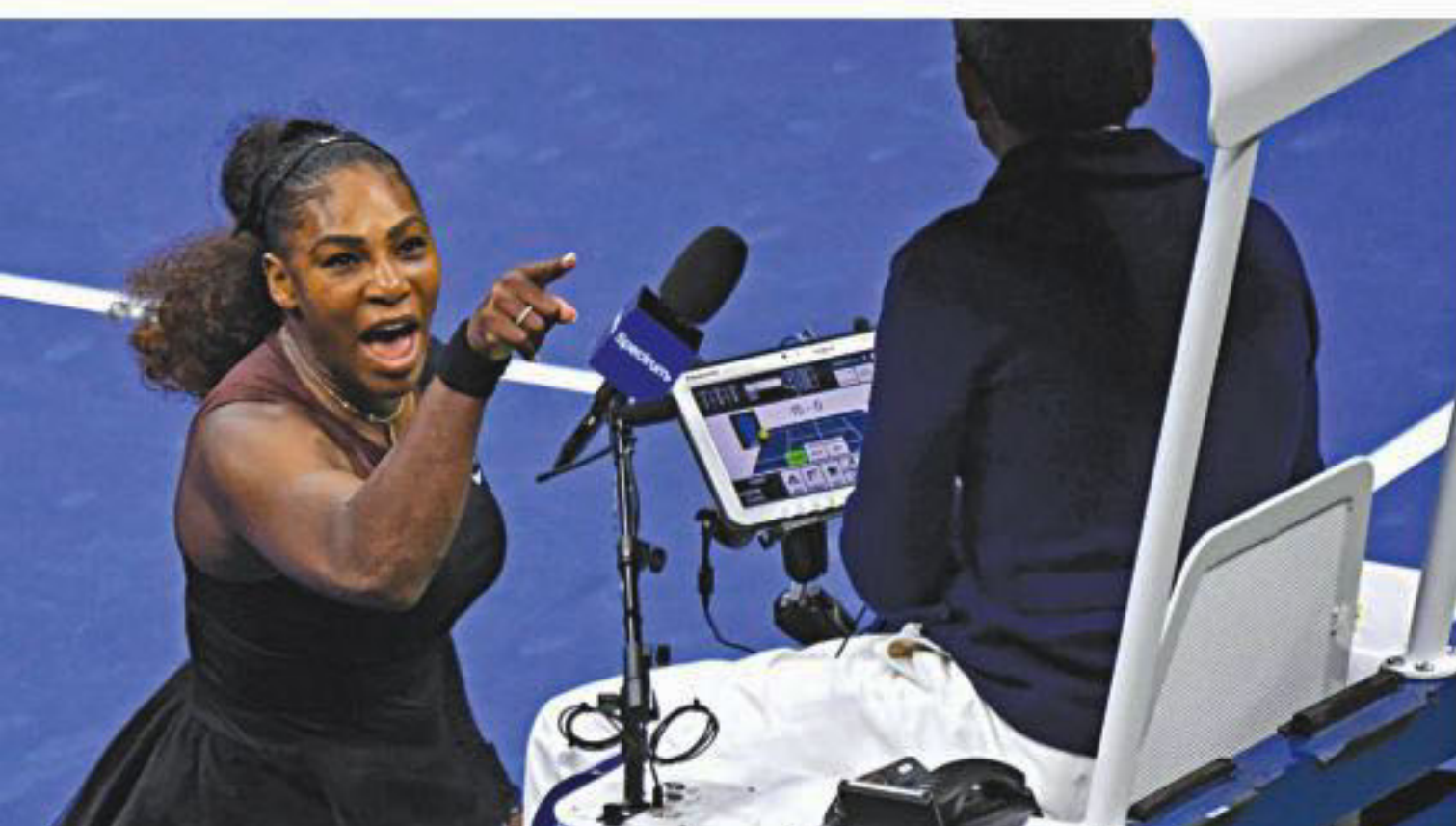
Serena Williams had a meltdown while losing to Naomi Osaka in the US Open final, launching an epic tirade against the umpires.