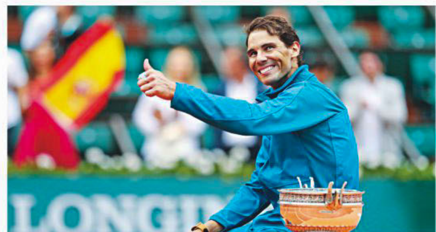
Rafael Nadal was no slouch either, complementing the 2017 that saw him win two Grand Slams, with a record-extending 11th French Open title.