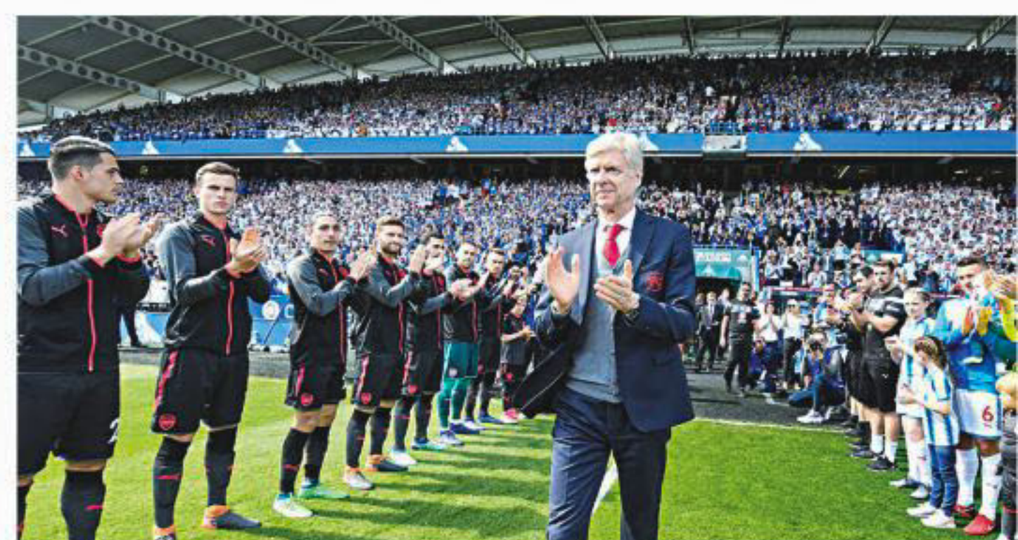
After 22 years at the helm of Arsenal, manager Arsene Wenger decided to step down from his role and leave the club, having left an ever-lasting impact on English football.