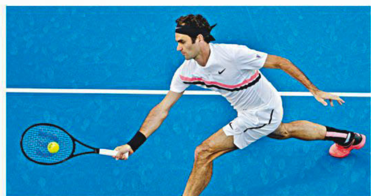
Roger Federer started the year in fine fashion, winning the Australian Open and extending his record haul of Grand Slam triumphs to 20.