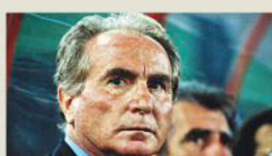
AZEGLIO VICINI 1933-2018

Former India Test and ODI captain Ajit Wadekar died at the age of 77.