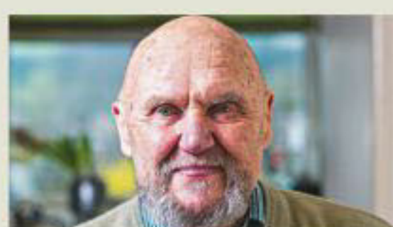
RAY WILSON 1935-2018

Fiorentina captain and Italy international Davide Astori died of a 'sudden illness' in March.