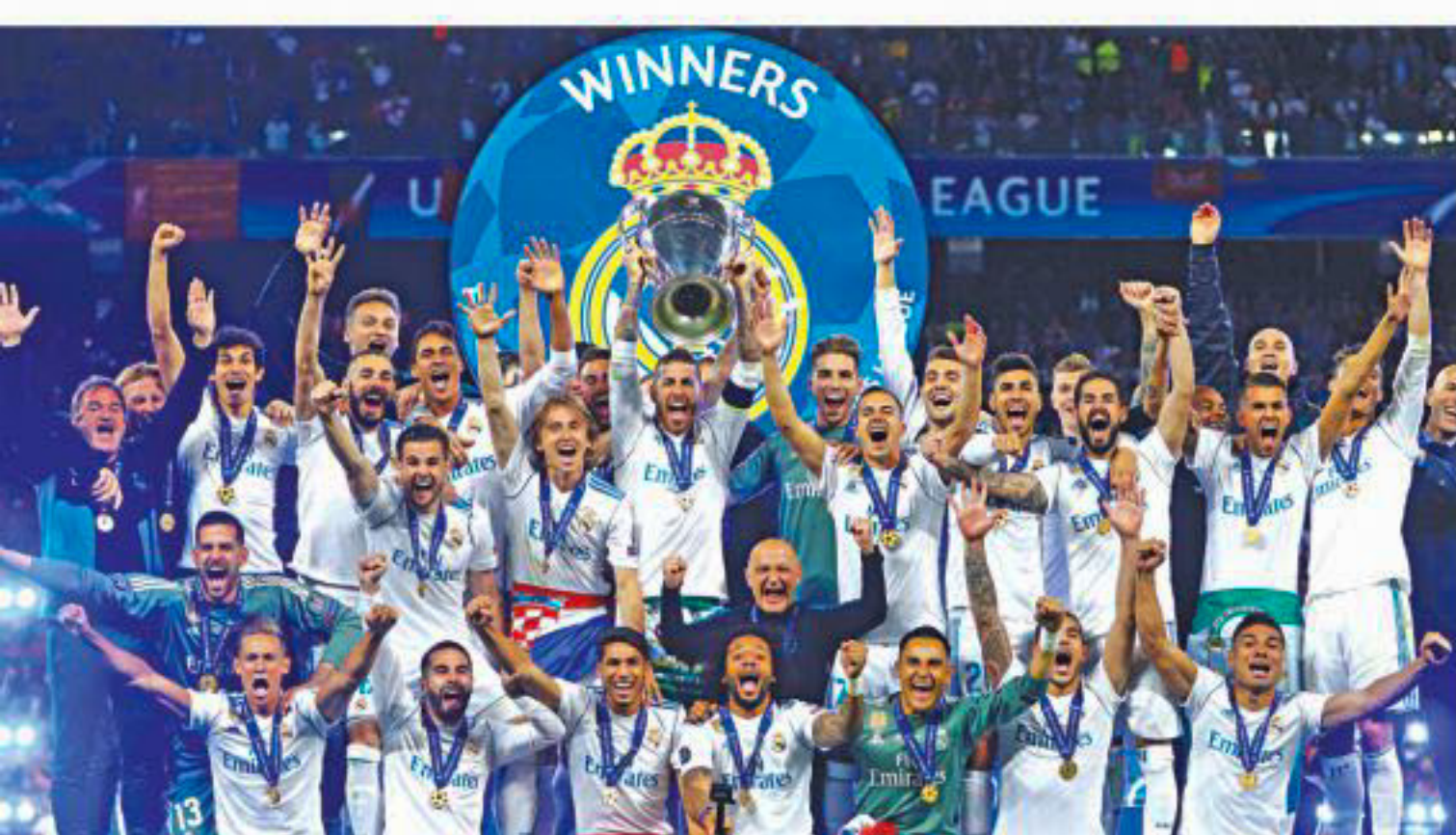
After becoming the first club to ever retain the Champions League Real Madrid captured Europe's greatest prize for a third time running.