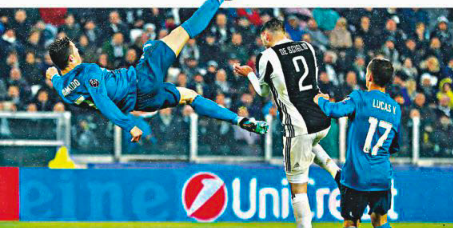
Cristiano Ronaldo scored a gravity-defying goal, but even more shocking was his move from Real Madrid to Juventus in the summer.