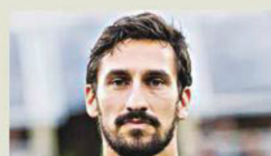
DAVIDE ASTORI 1987-2018