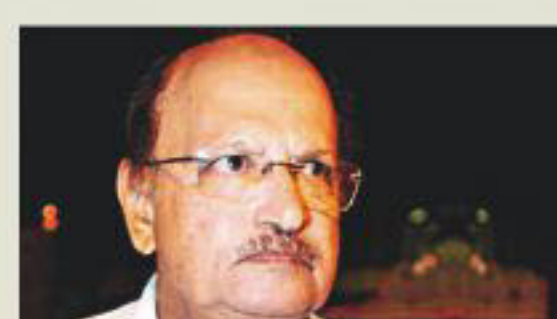
AJIT WADEKAR 1941-2018

Former India Test and ODI captain Ajit Wadekar died at the age of 77.