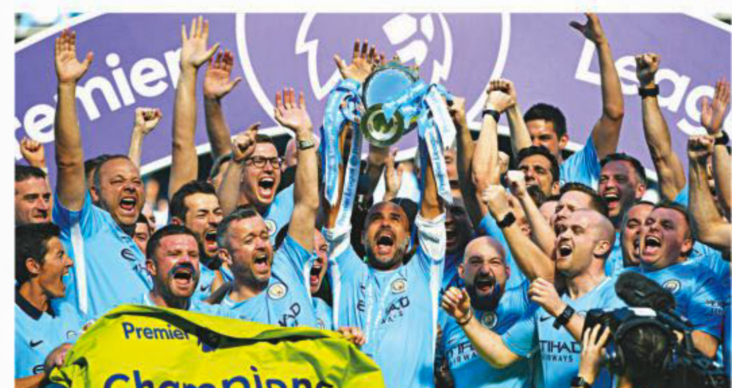
Pep Guardiola's Manchester City broke numerous records on way to the Premier League title.