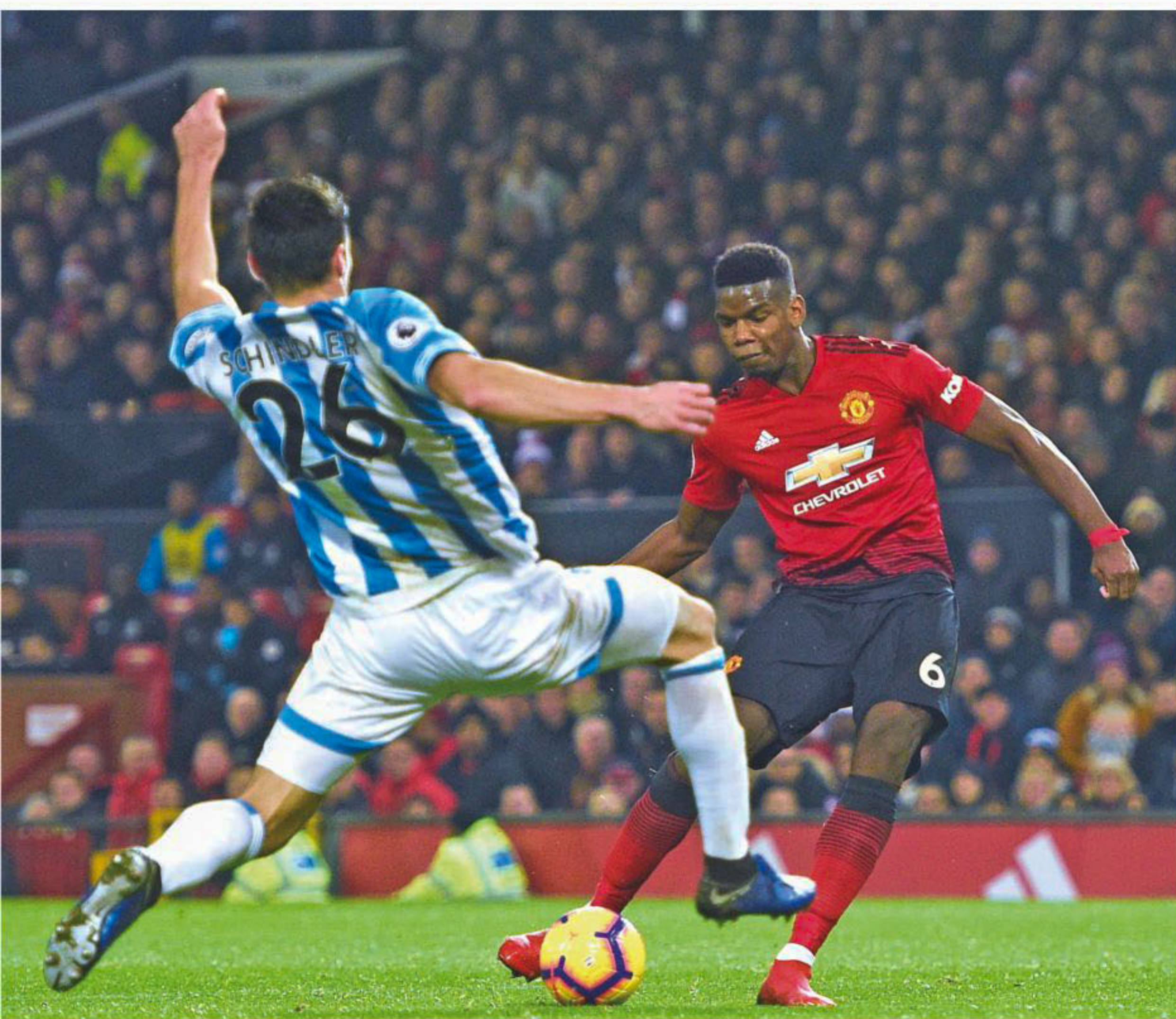
Manchester United's French midfielder Paul Pogba scores his side's second goal against Huddersfield Town at Old Trafford on Wednesday.