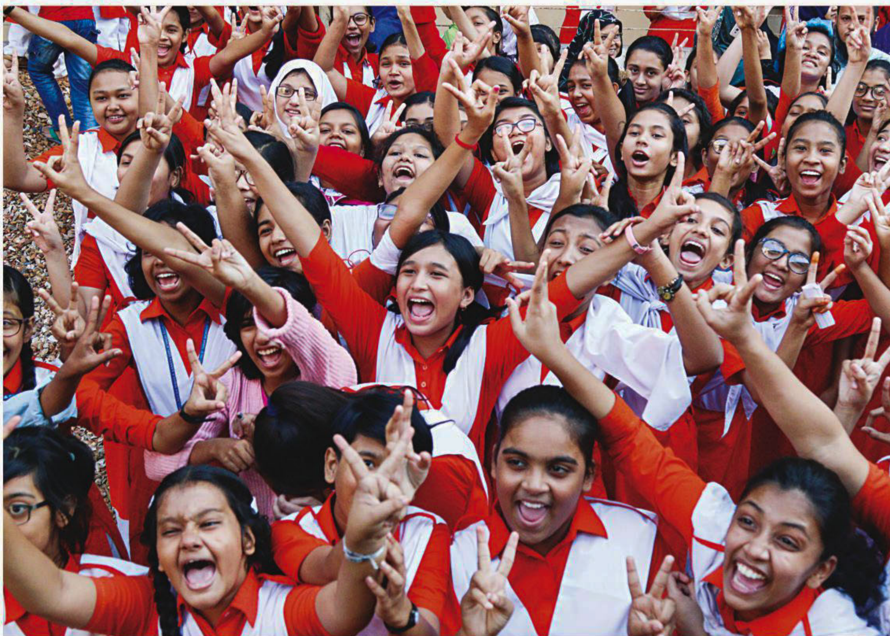
Jubilant students of Bangladesh Mahila Samity Girls High School and College in Chattogram city flash V-sign after the results of Junior School Certificate examination were out yesterday.