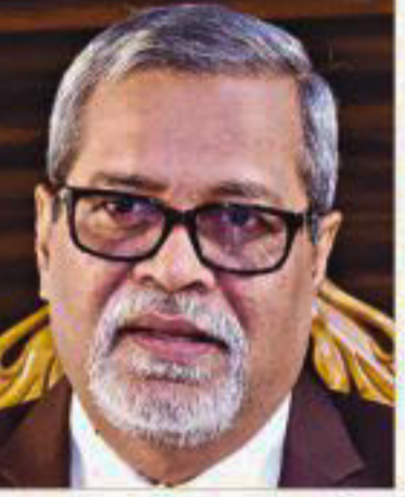
KM Nurul Huda

Chief Election Commissioner KM Nurul Huda yesterday said army personnel deployed for election duty would take any measures required to maintain law and order.