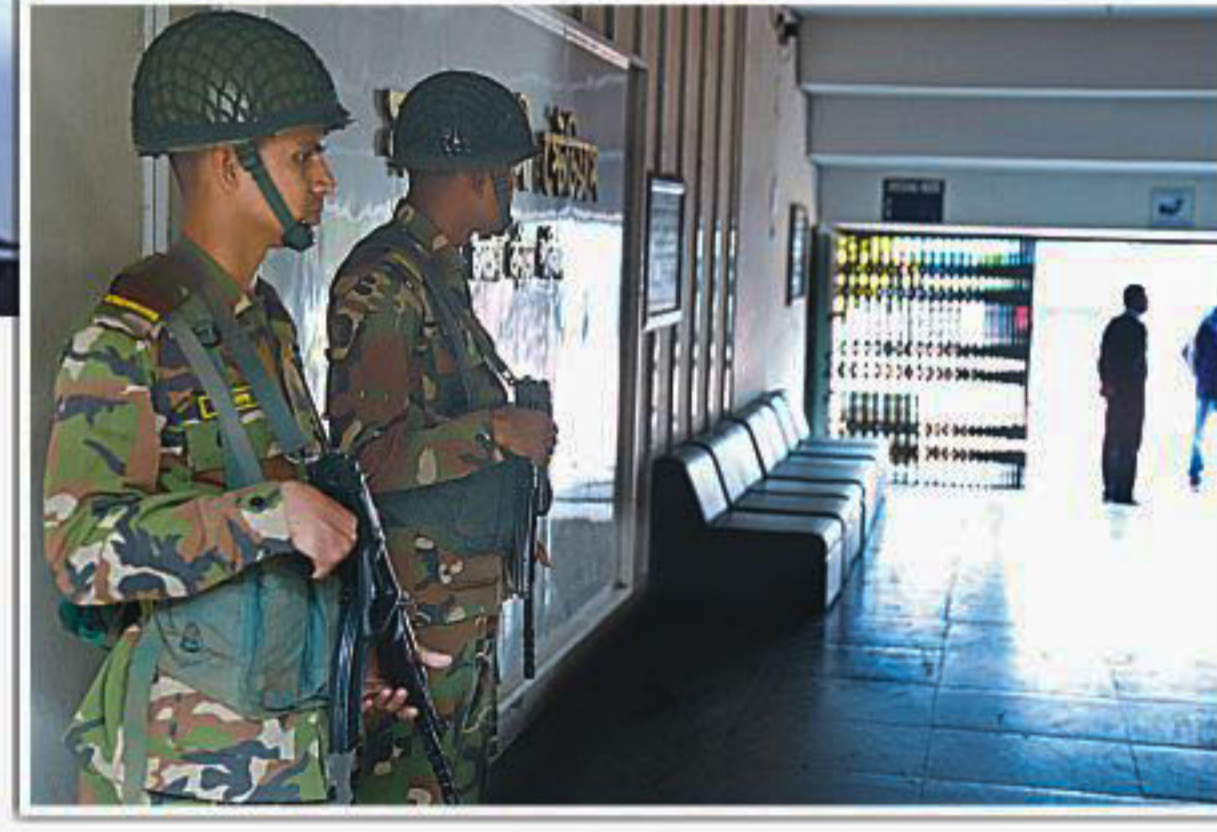
A team of army personnel patrols Dewanhat Overpass area in Chattogram city. Members of the armed forces started election duties across the country yesterday. Inset, soldiers stand guard outside a temporary camp set up at the capital's Maulana Bhasani Hockey Stadium.