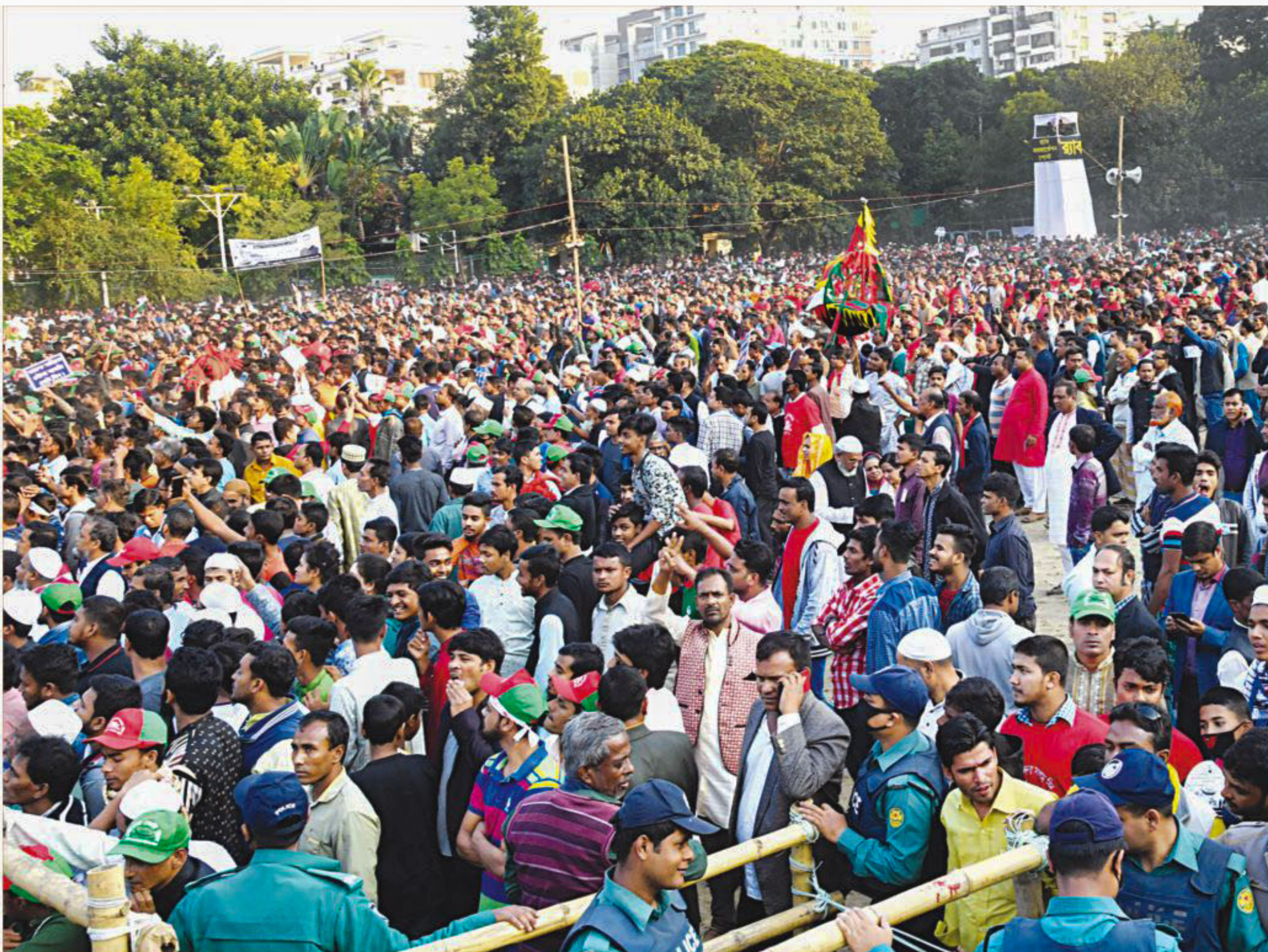
The crowd at an Awami League rally organised at the Gulshan Youth Club ground yesterday to campaign for December 30 parliamentary polls.