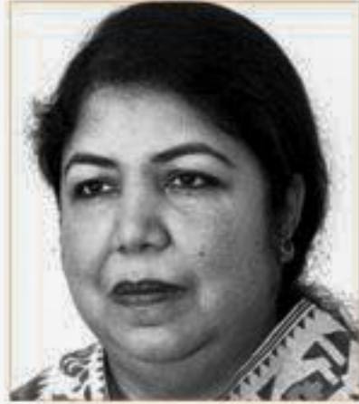
Shirin Sharmin Chaudhury

Rangpur-2 (Badarganj and Taraganj upazilas): The constituency has been a fortress of AL and JP as candidates of both the parties were elected lawmakers for five times each since 1973.