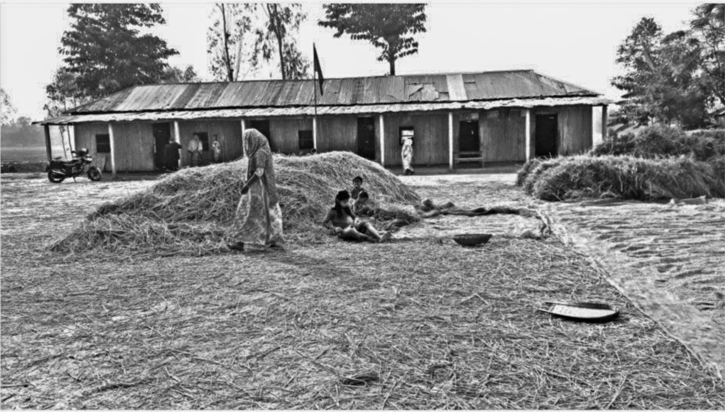
Paddy processing on the playground at Adarshapara Government Primary School in Hatibandha upazila of Lalmonirhat.

UNO Umme Fatima said disrupting communication and damaging government structure are punishable offence and they will conduct mobile court against the brick kiln soon.