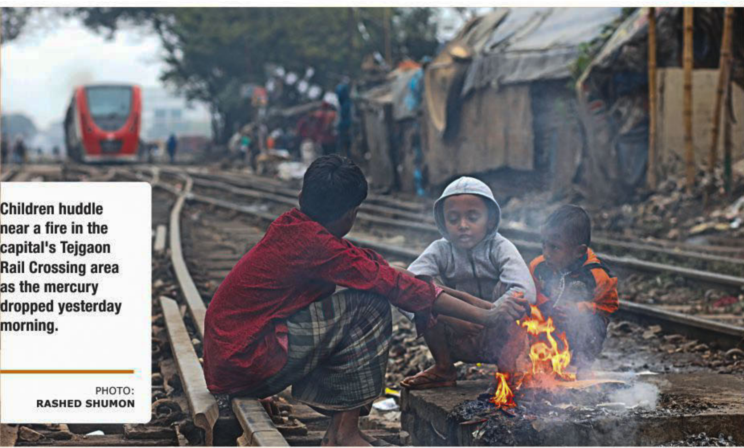
Children huddle near a fire in the capital's Tejgaon Rail Crossing area as the mercury dropped yesterday morning.